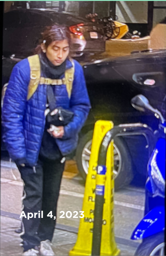
April 4, 2023