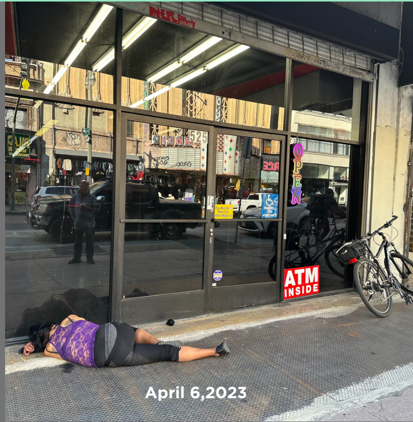
April 6, 2023