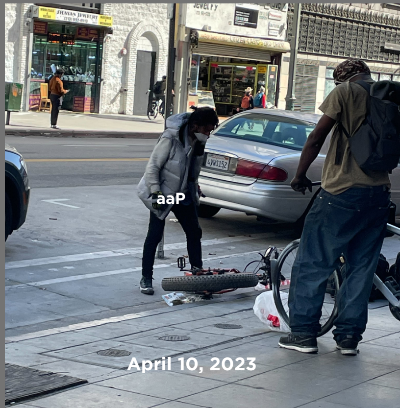
April 10, 2023