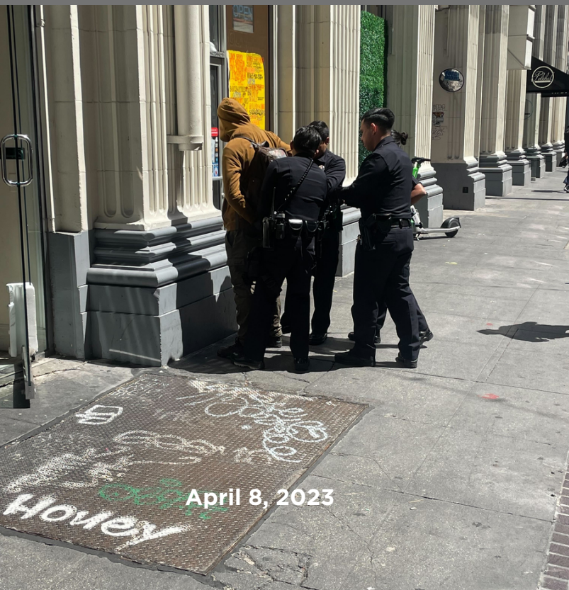
April 8, 2023