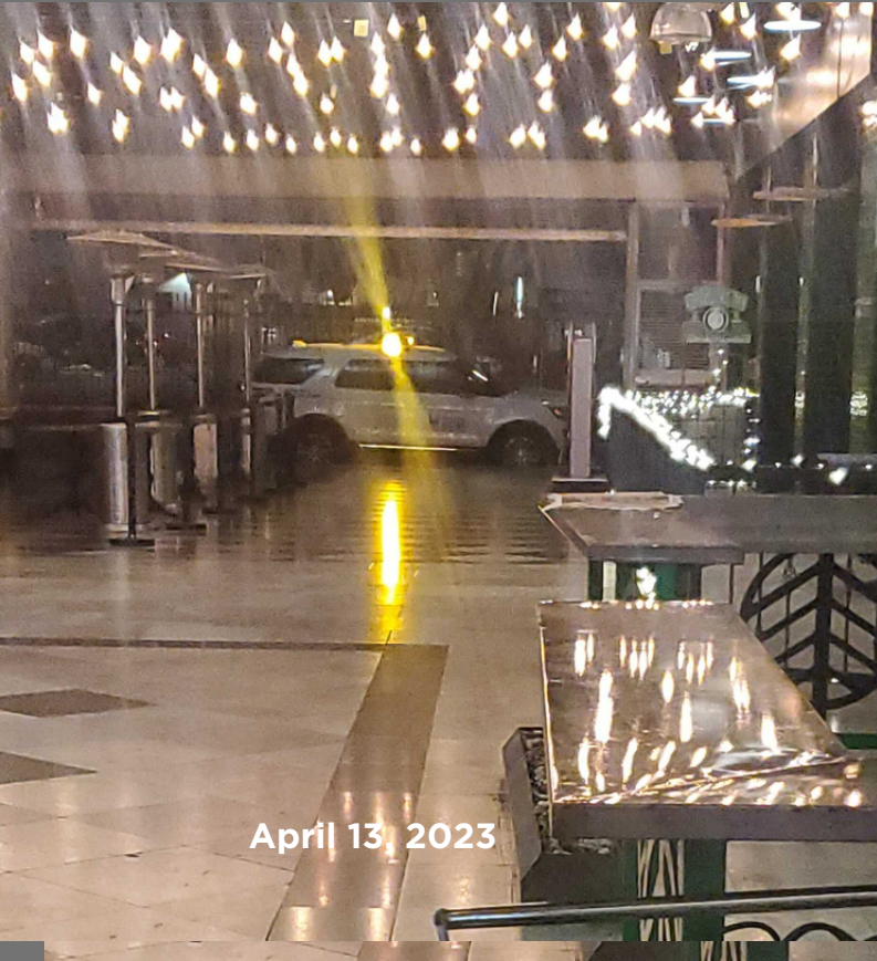
April 13, 2023