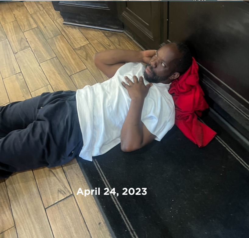
April 24, 2023