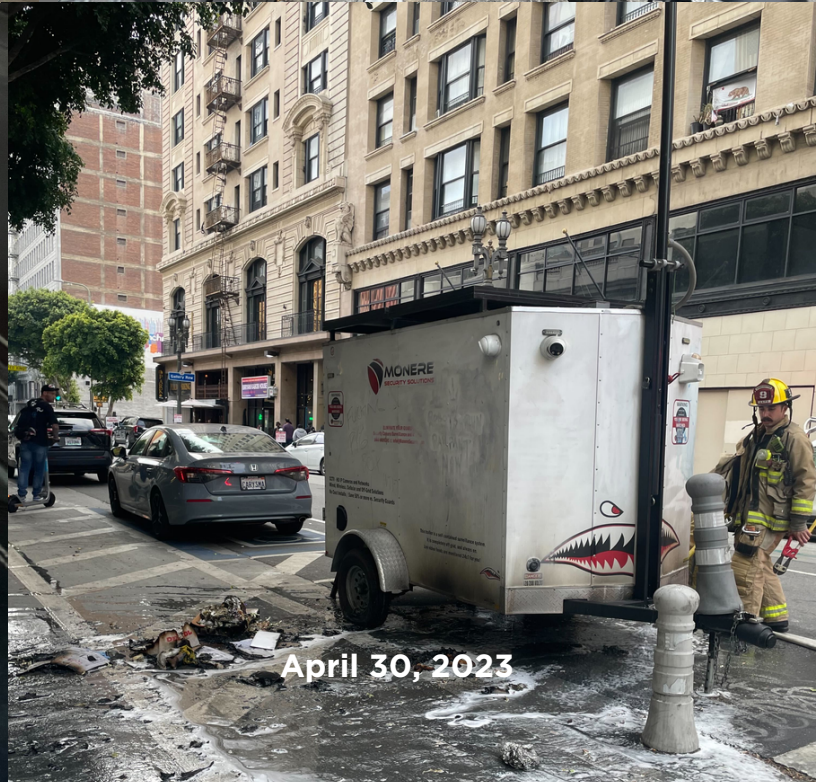
April 30, 2023