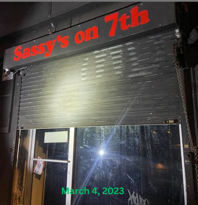
March 4, 2023