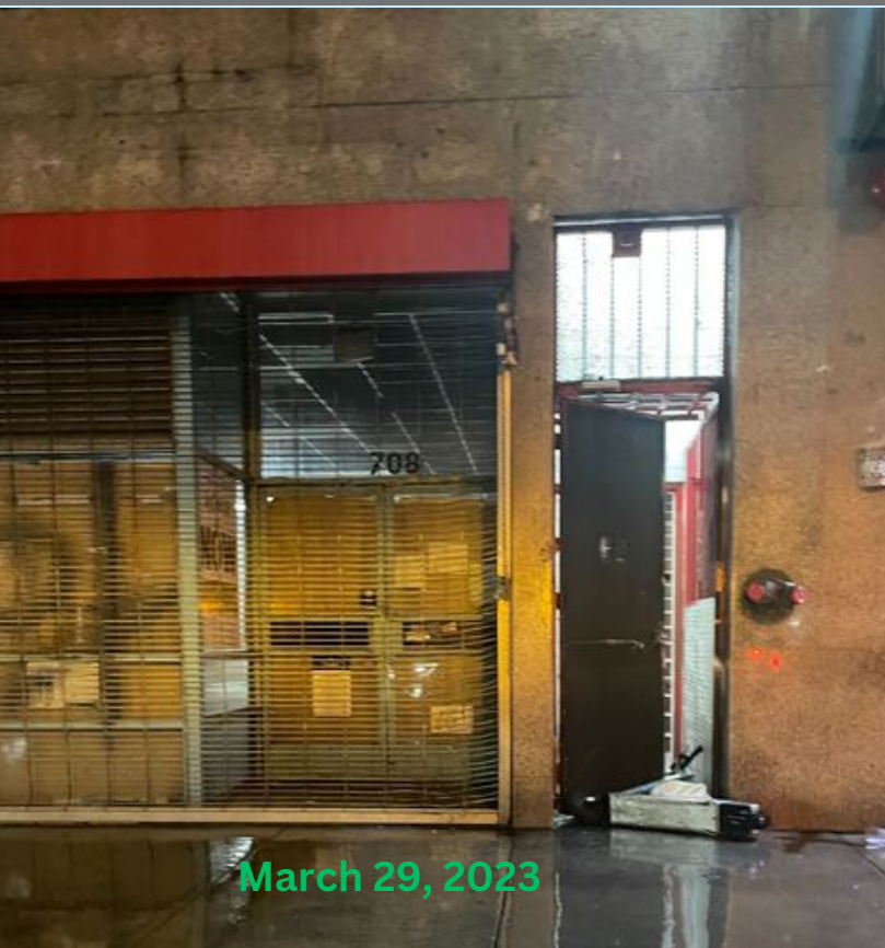
March 29, 2023