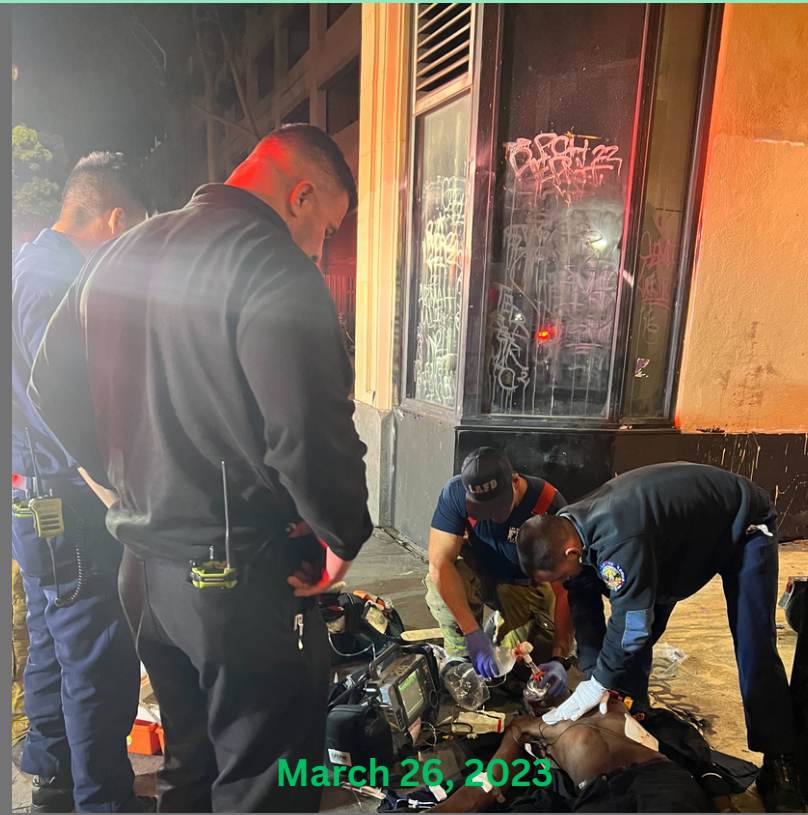
March 26, 2023