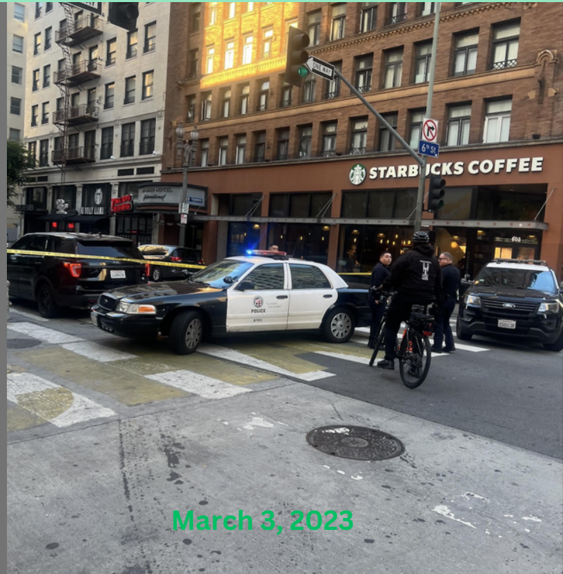
March 3, 2023