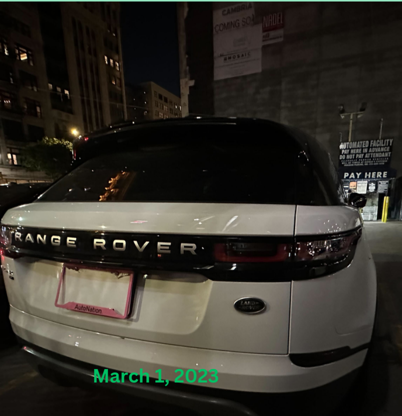
March 1, 2023