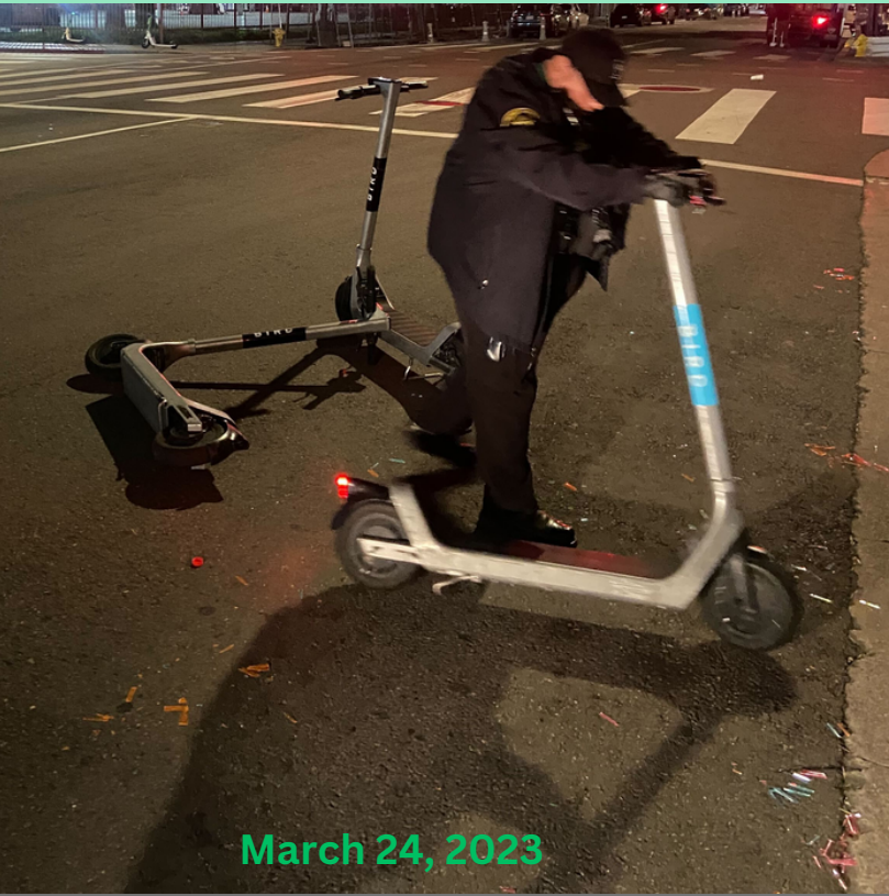
March 24, 2023