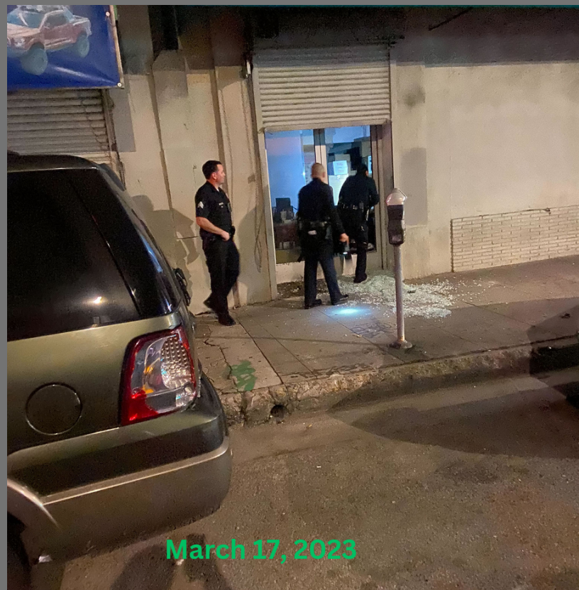
March 17, 2023