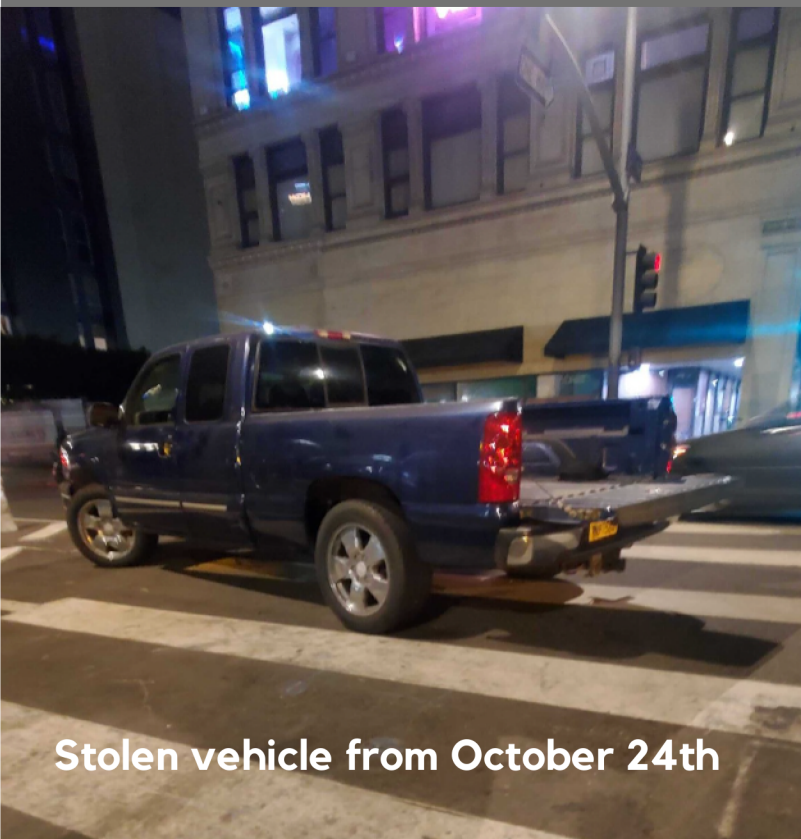
Stolen vehicle from October 24th