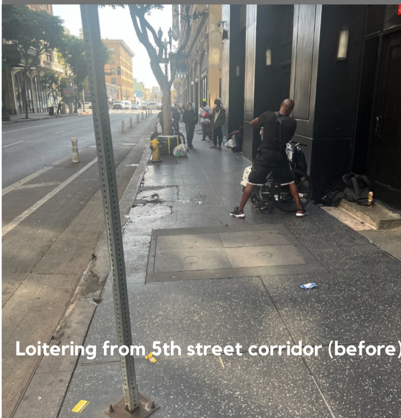
Loitering from 5th street corridor (before)