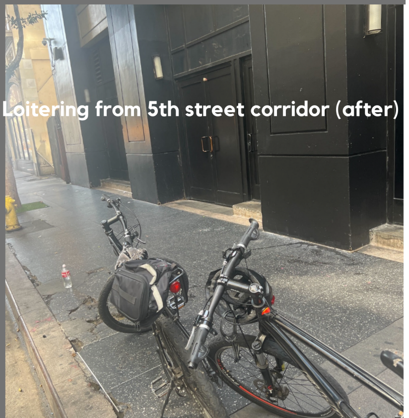
Loitering from 5th street corridor (after)