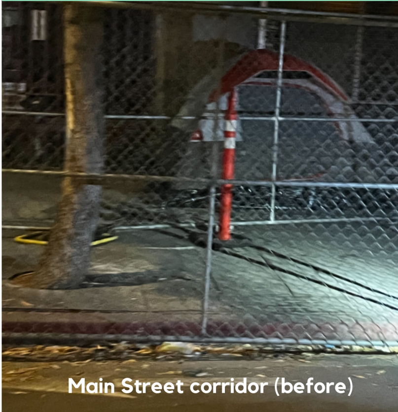
Main Street corridor (before)

The following data and information is provided to the Historic Core BID for tracking purposes. The information contained in this report is for activities reported in November 2022. The data and information is obtained from ambassadors conducting patrols and entered in Statview.