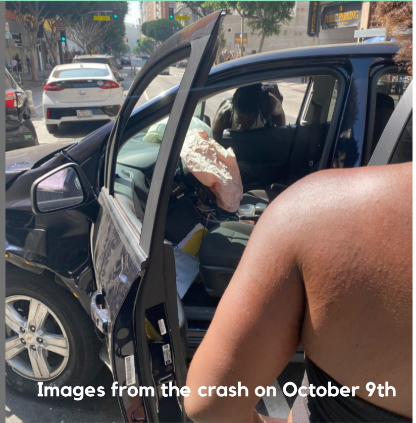
Images from the crash on October 9th