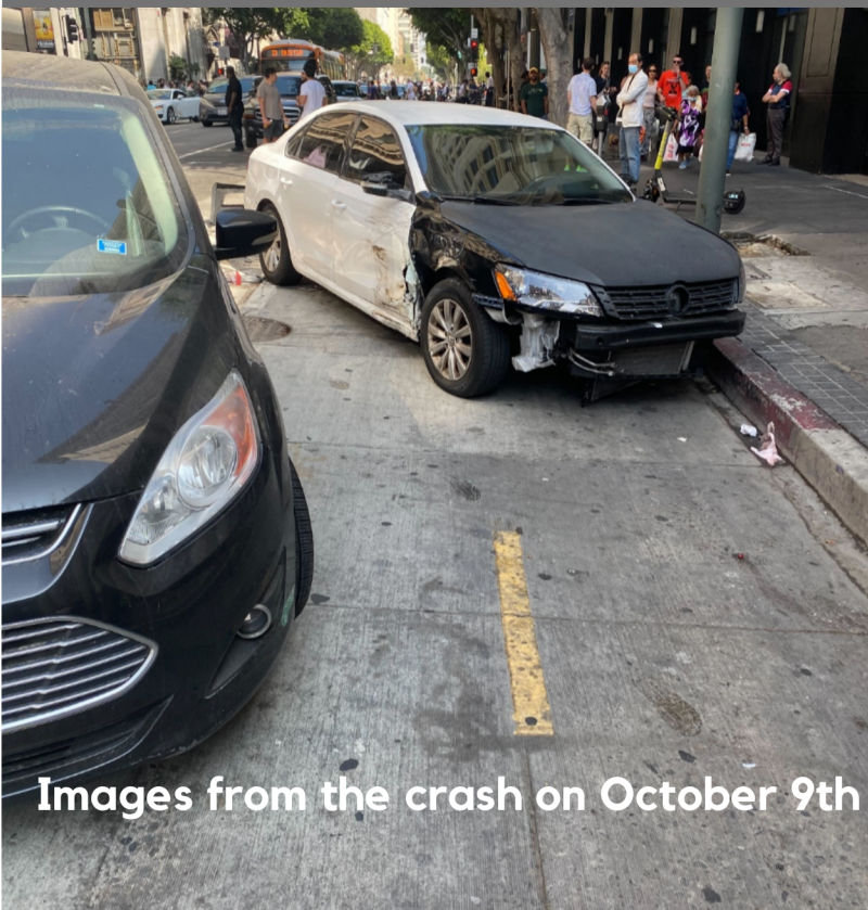
Images from the crash on October 9th