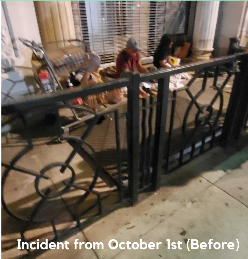
Incident from October 1st (Before)

The following data and information is provided to the Historic Core BID for tracking purposes. The information contained in this report is for activities reported in November 2022. The data and information is obtained from ambassadors conducting patrols and entered in Statview.