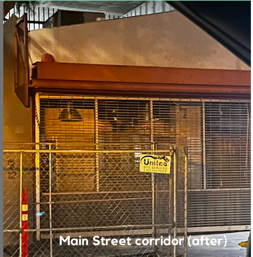
Main Street corridor (after)