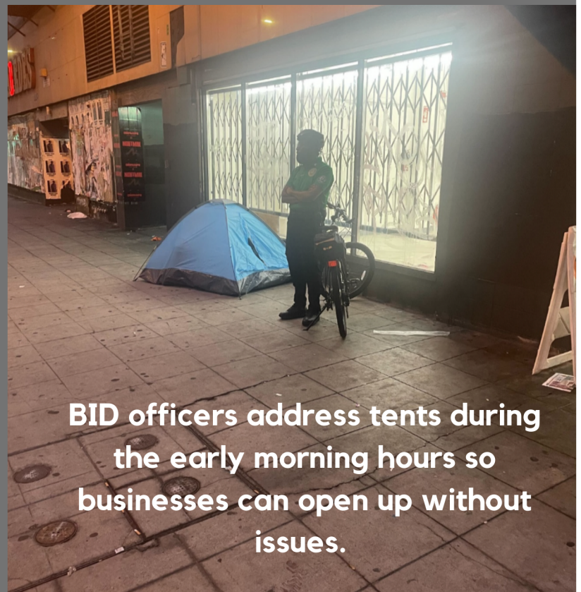
BID officers address tents during the early morning hours so businesses can open up without issues.