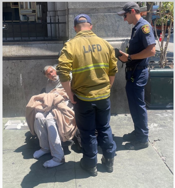
LAFD was dispatched by BID officers in order to assist an elderly gentleman.