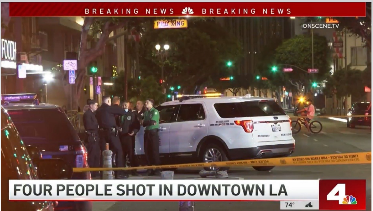
The incident from July 21st made front page headlines throughout the city.