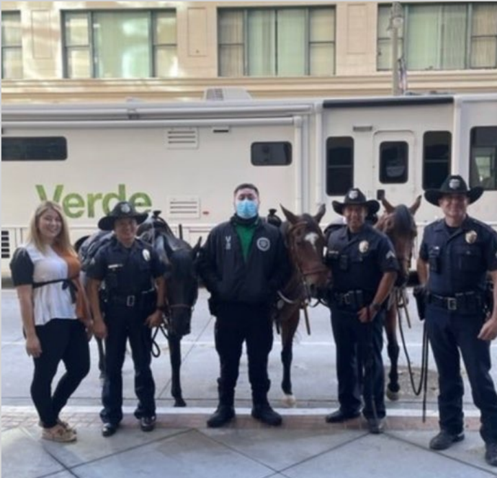
LAPD and Street plus casually walking the historic core district.