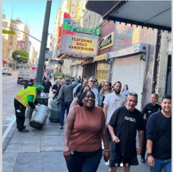
Residents, business owners, and many others came down to walk a beat with LAPD and the BID.