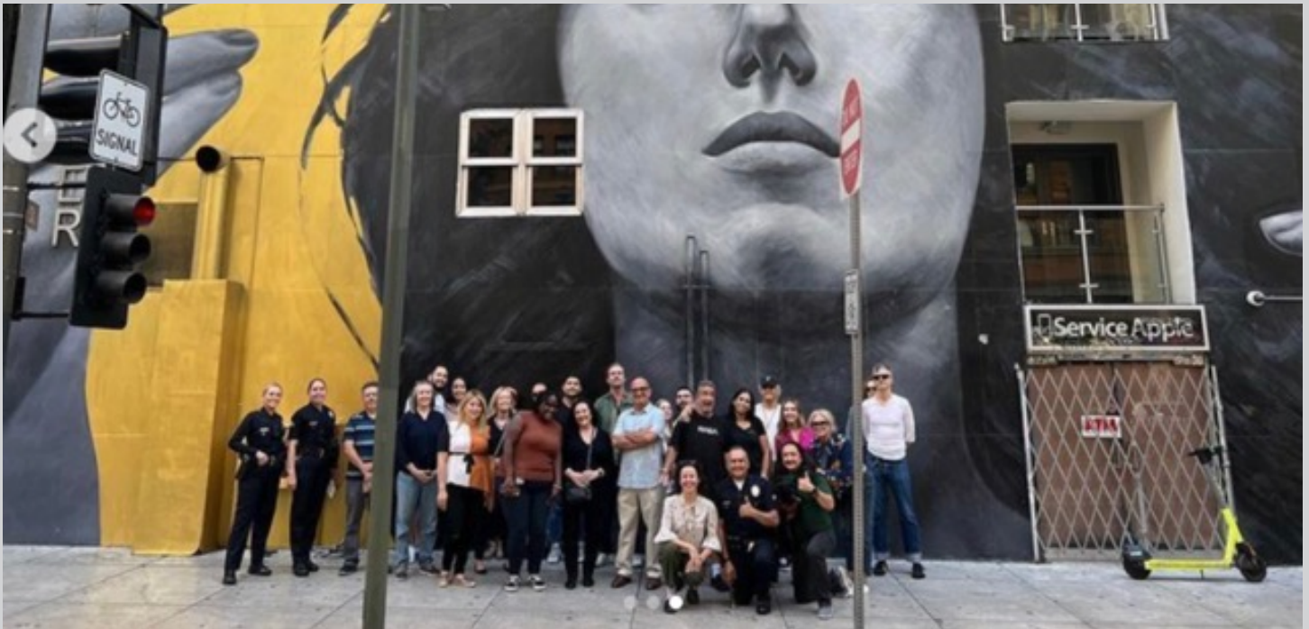
Such a great turnout from the community.