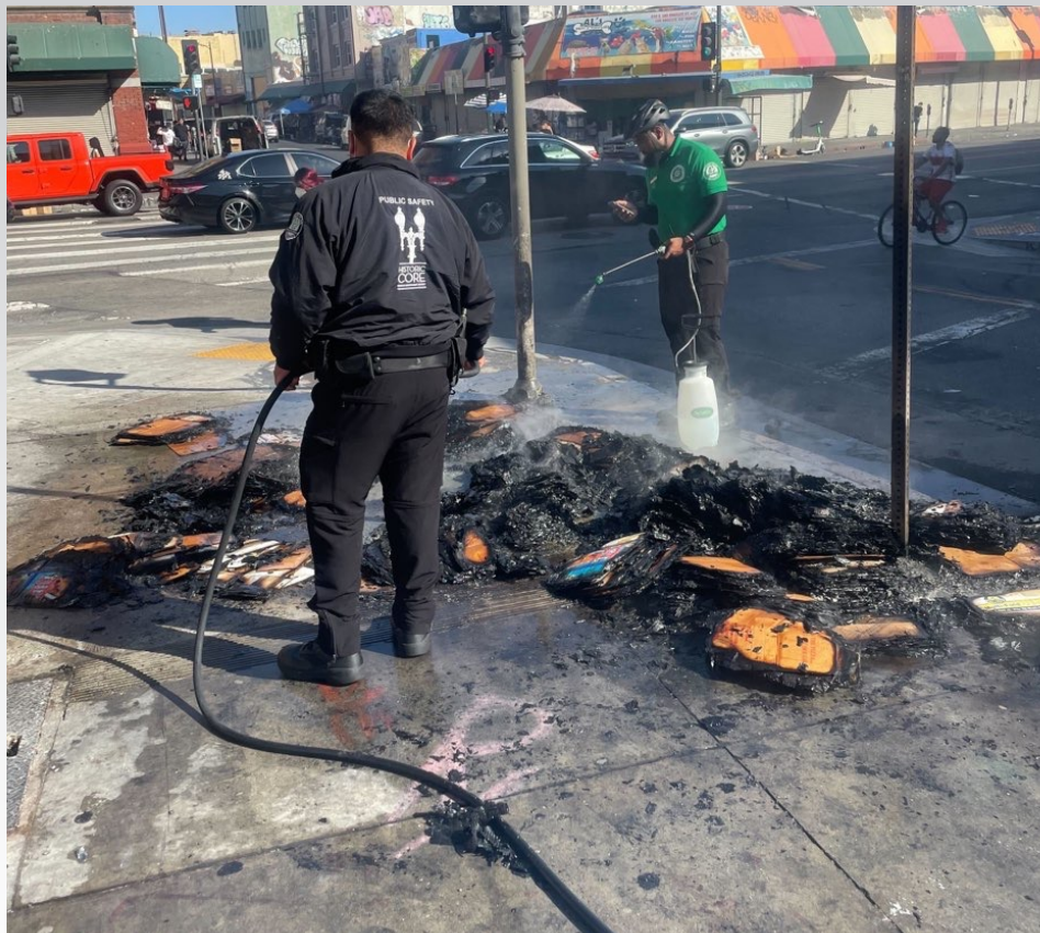
BID officers worked quickly to extinguish the flames.