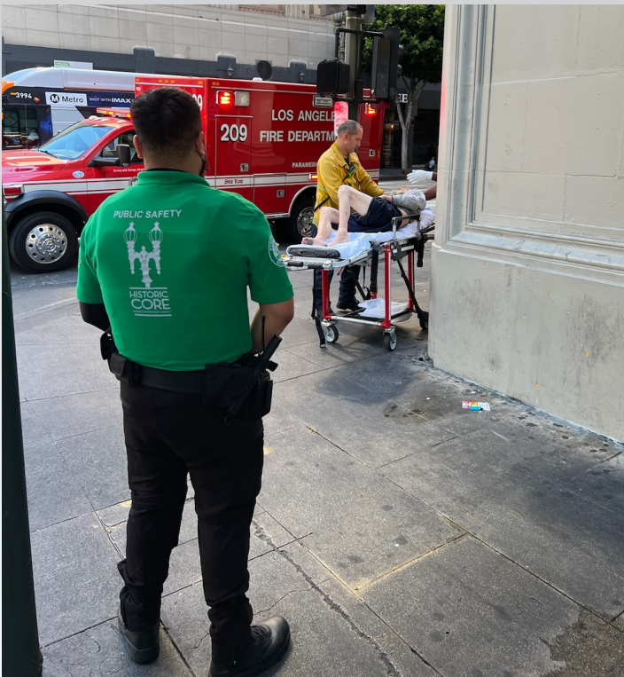
In the month of July we had several overdose cases.