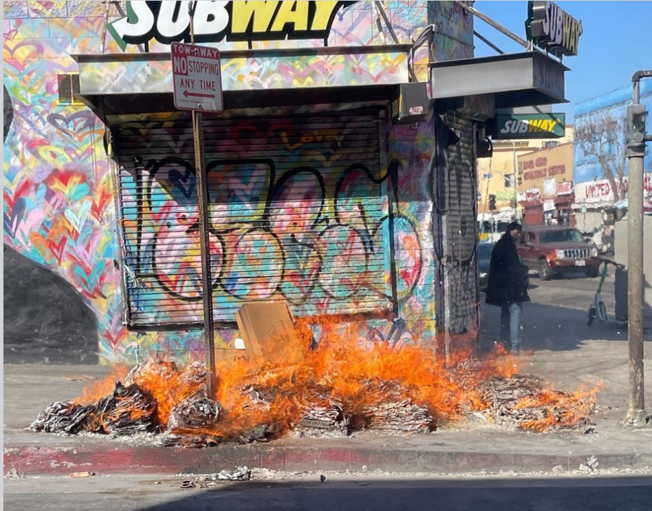
The fire that was discovered by BID officers on Winston and Los Angeles.