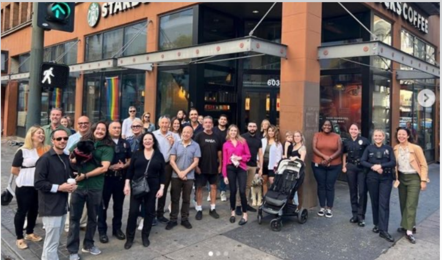
Walk with a cop was a huge success!