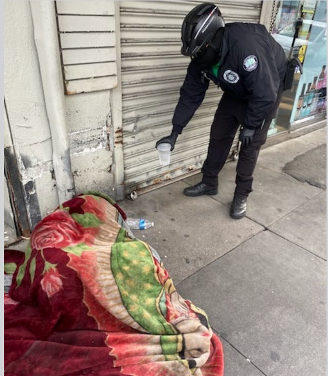
As the days start to heat up, BID officers prepare to pass out waters to those in need.