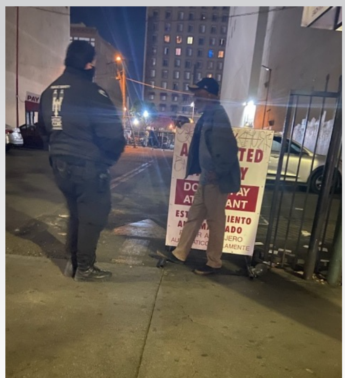
BID officers also play a huge role with community engagement. Here we have a BID officer engaging in a casual conversation with a member of the street population.