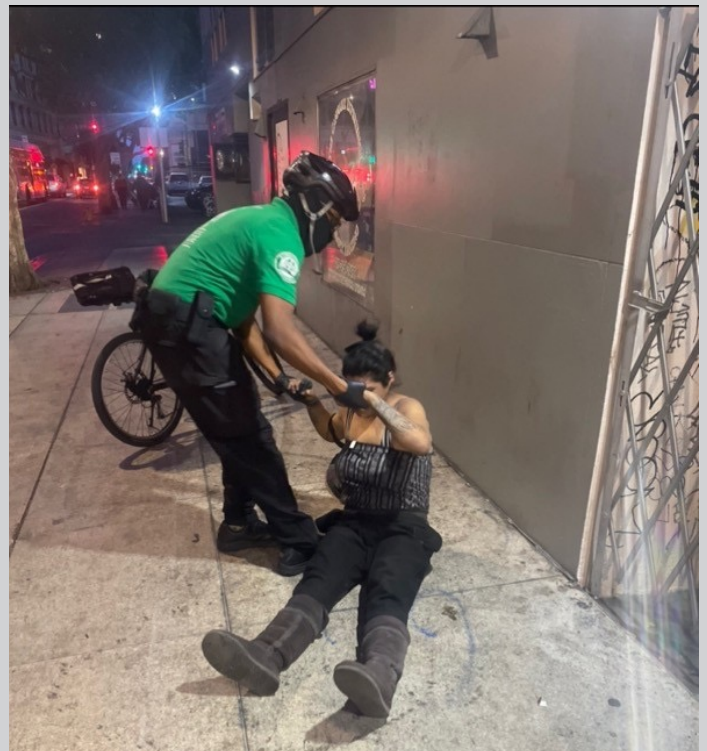
Need a helping hand? Please reach out to our Green Shirts!