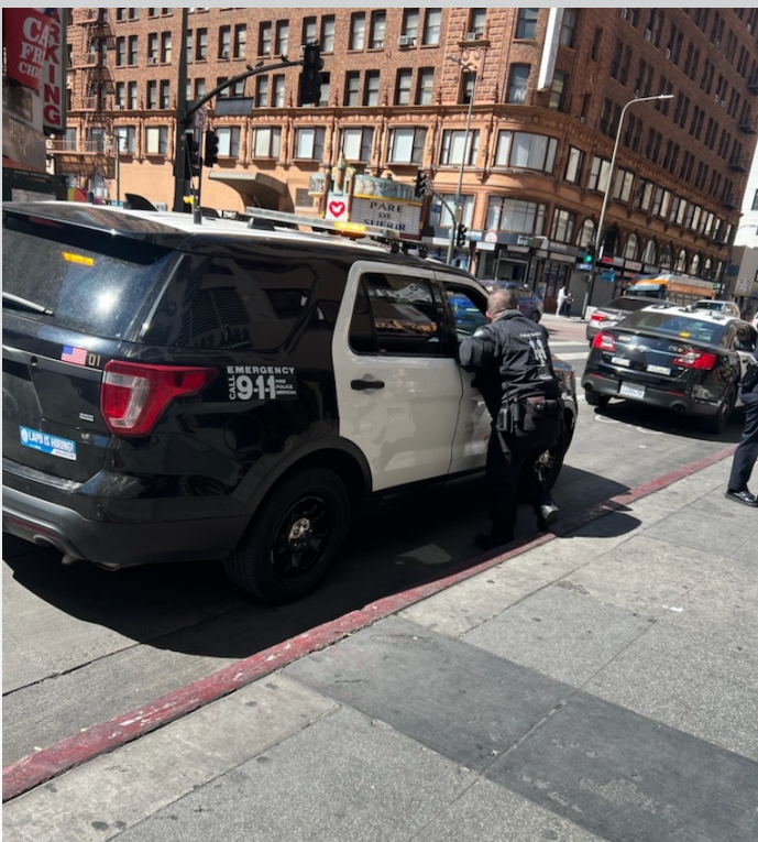
BID officers stay in constant communication with LAPD in order to be updated with current crime trends.