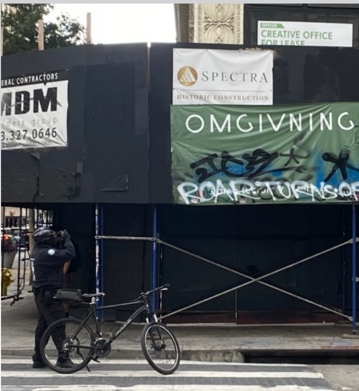
BID officers work closely with our Maintenance provider in addressing all maintenance needs.