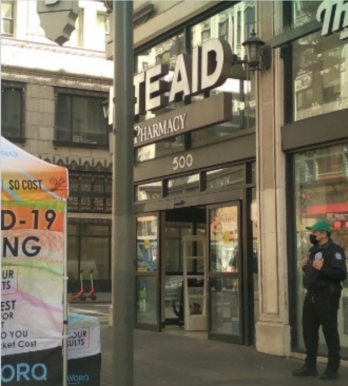
BID officers don't enforce, but can educate vendors on the legality of setting up in public spaces.