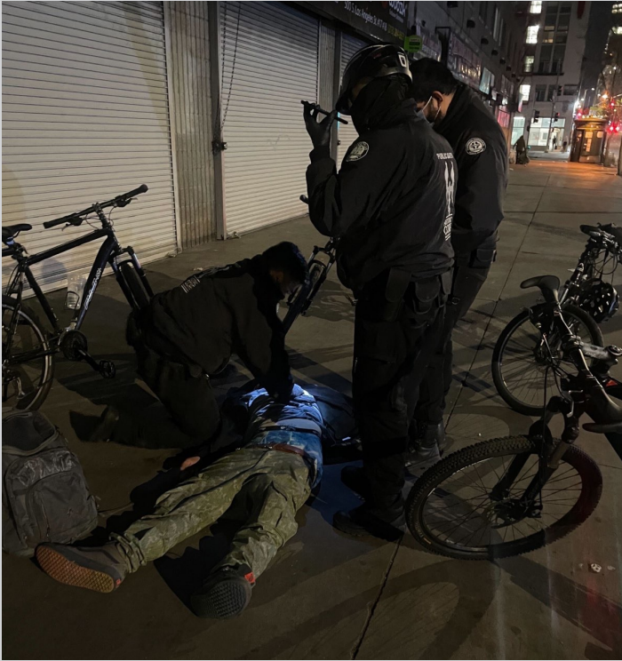
Because of these life saving measures, BID officers were able to stabilize the individuals breathing.