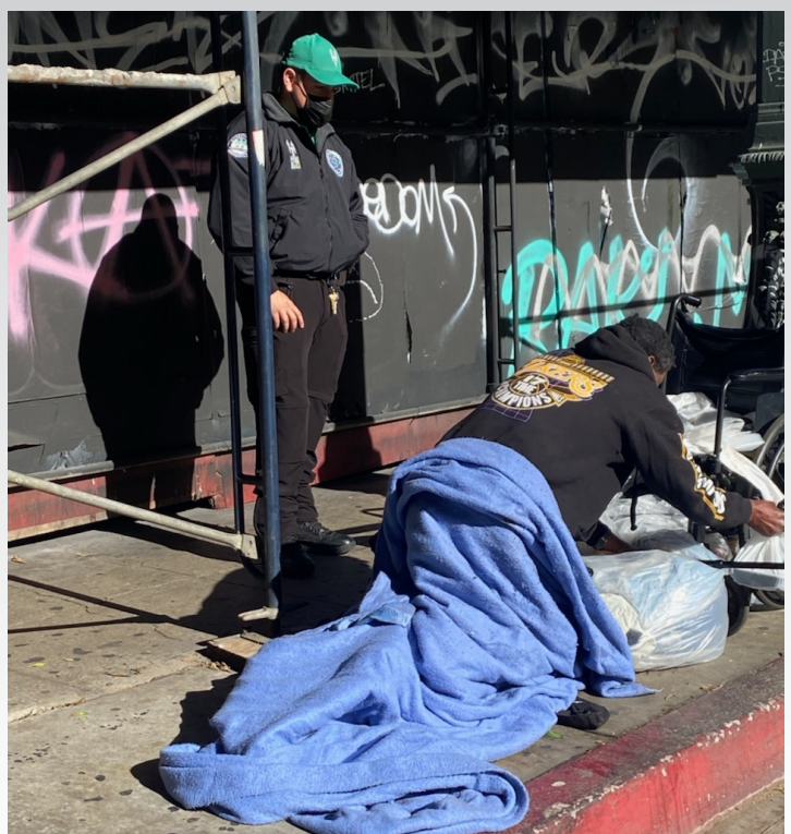
Throughout the early AM hours, BID officers conduct routine wellness checks on members of the street population.