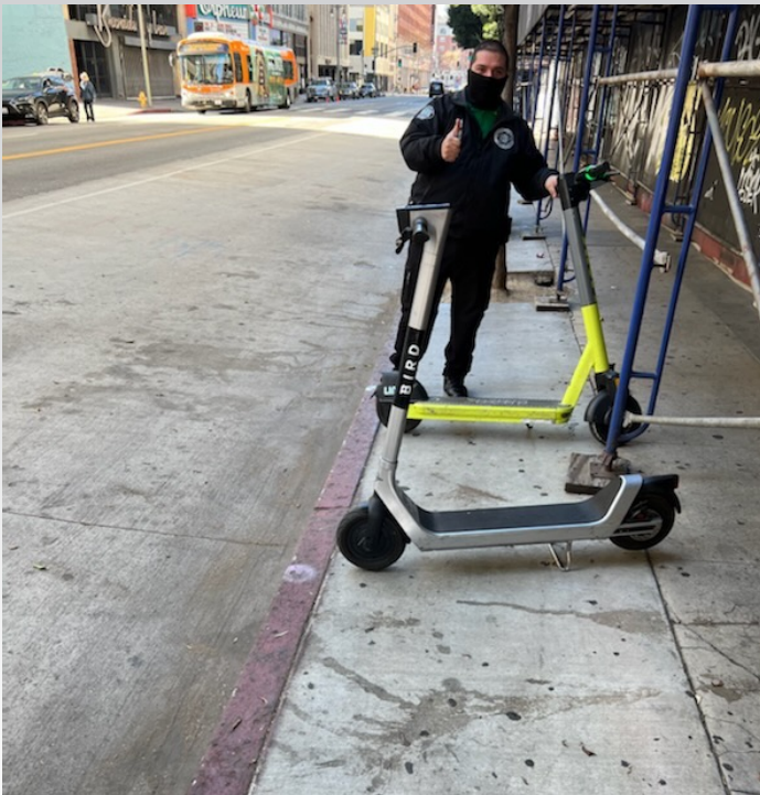
Picking up scooters is just another daily routine for these folks.