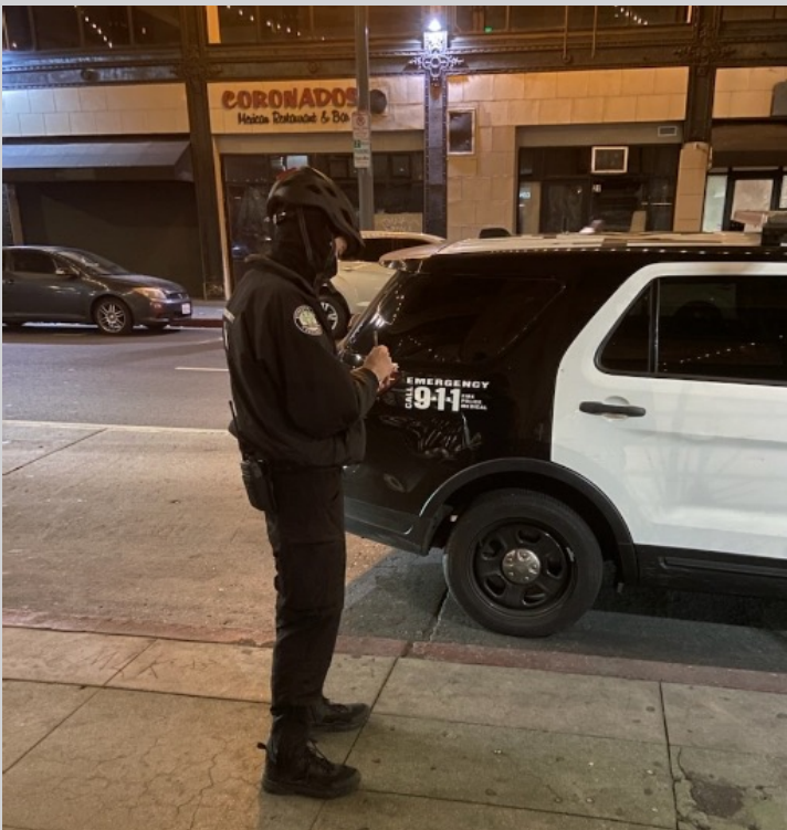
When needed, BID officers can assist LAPD with various tasks.