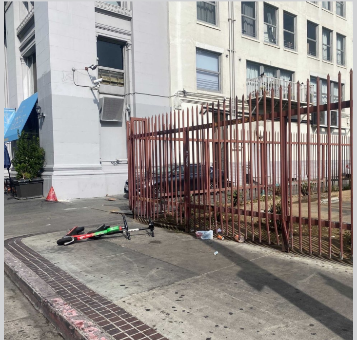
After: 6th and Harlem