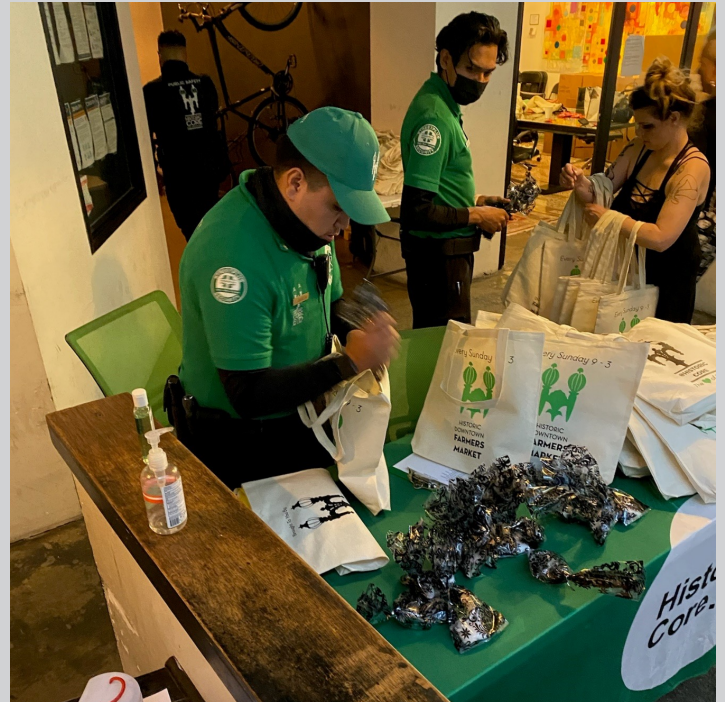
BID officers were present and assisted the office with their first ever walking tour!