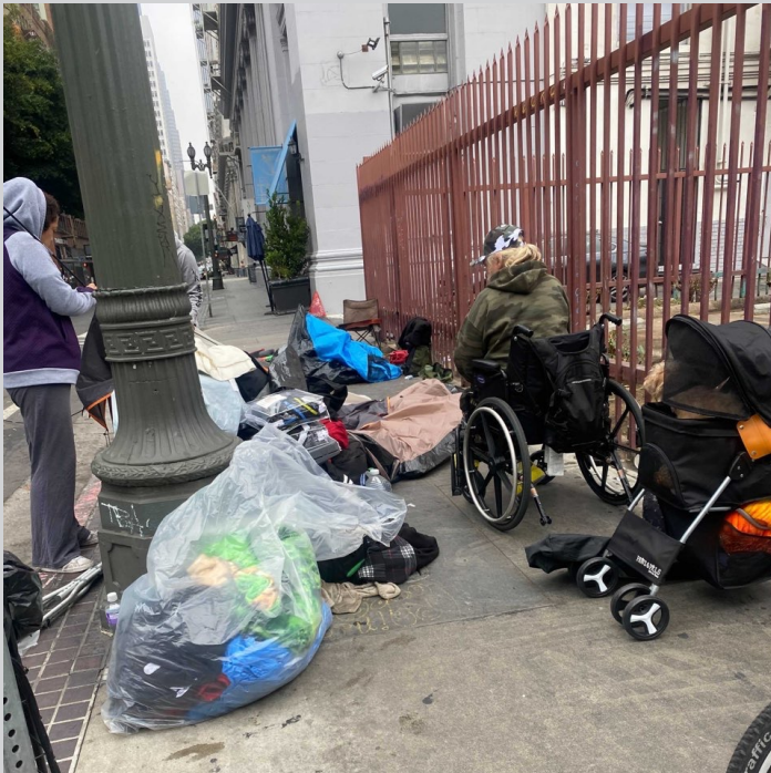
Before: 6th and Harlem