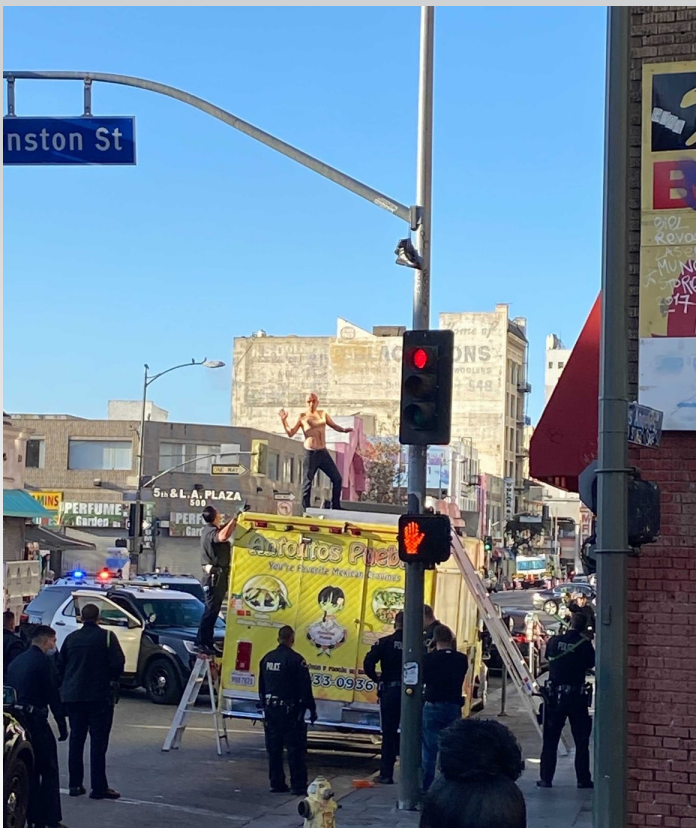
BID officers called LAPD for assistance since the individual was being noncooperative.