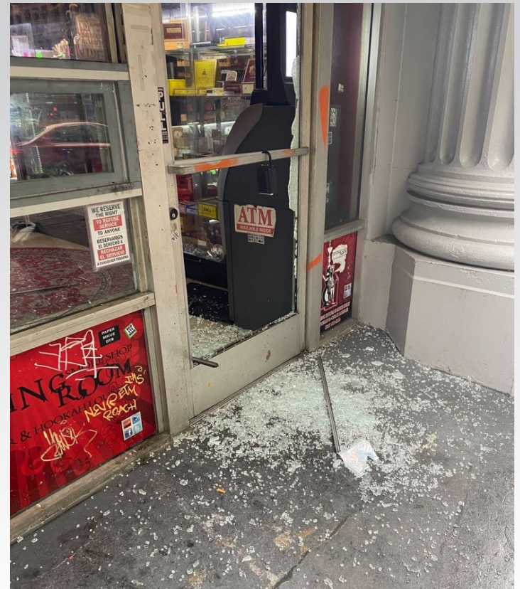
We had a total of 6 broken windows this month.