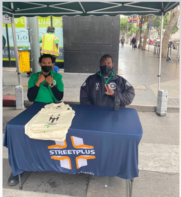
Be sure to pick up your Historic Core tote bag this Sunday at farmers market!