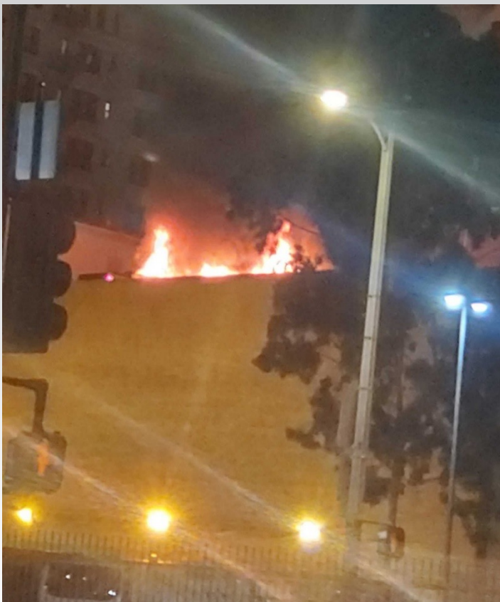
The fire at Joe's parking lot destroyed 4 vehicles.