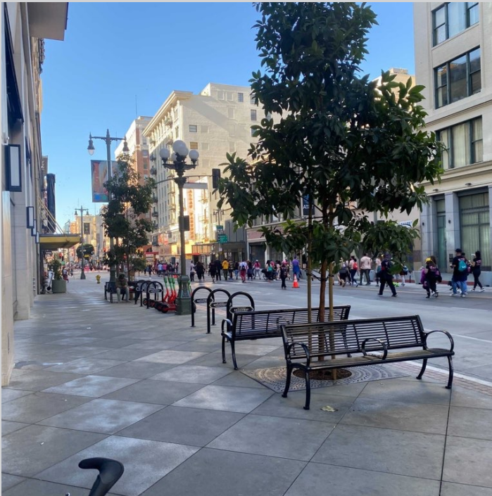
The breast cancer awareness march was very peaceful.