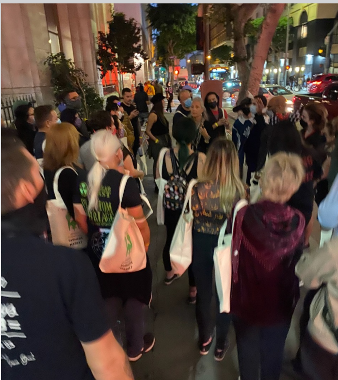
The BID's walking tour was a huge success! There were no incidents to report and everyone had a good time!