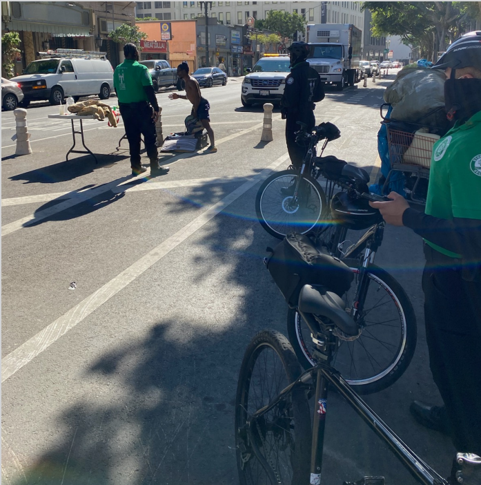
William attempted to setup at 623 S Main street. BID officers were successful in relocating him from the bike lane.