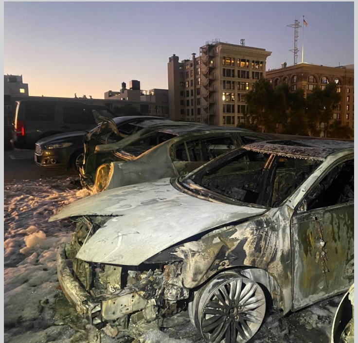
Aftermath of the fire at Joe's parking lot.