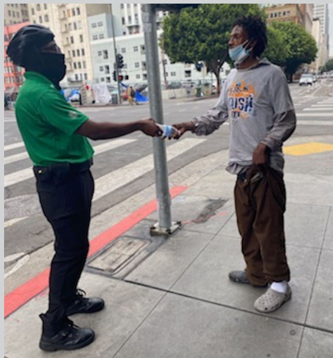
Another familiar face in the district!