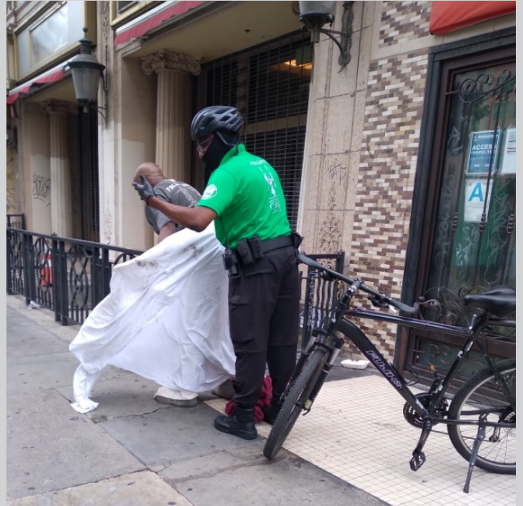
Wellness checks are conducted at all times even if a call was not generated.