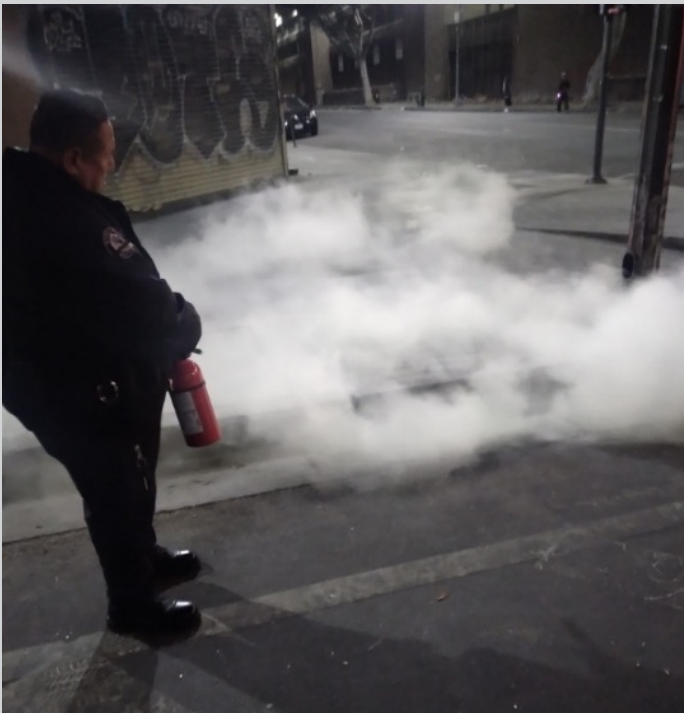
3rd shift officers put out a total of 5 fires during the month of September.