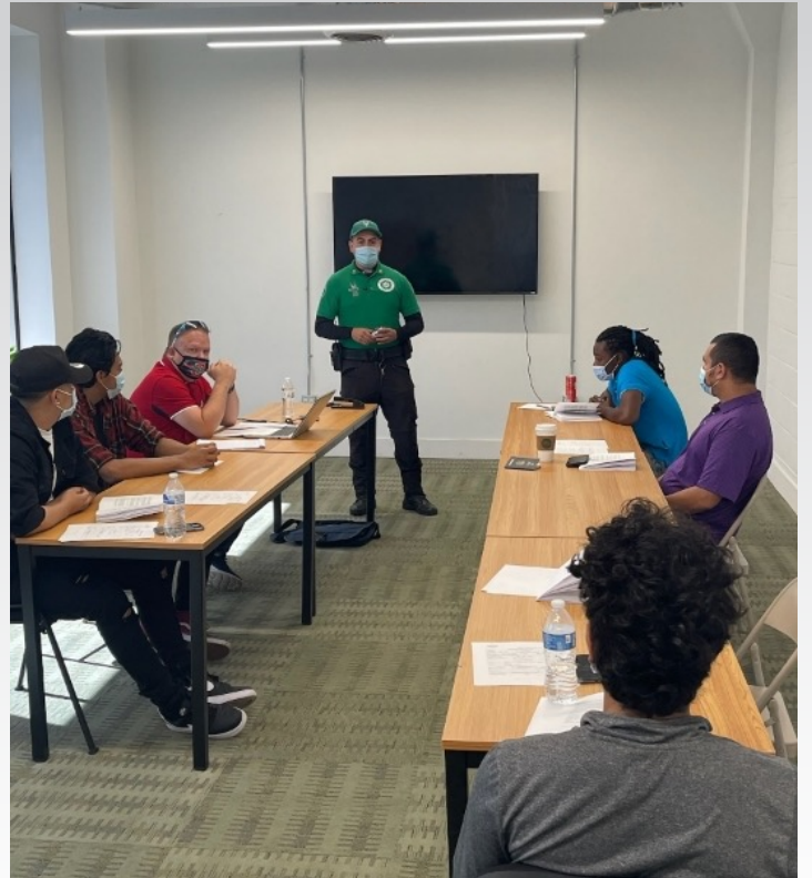
At the end of September, Street Plus was able to hire 5 new ambassadors to the team!