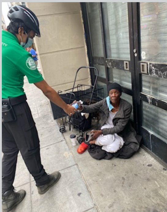
During hot days, BID officers can be seen distributing water bottles.