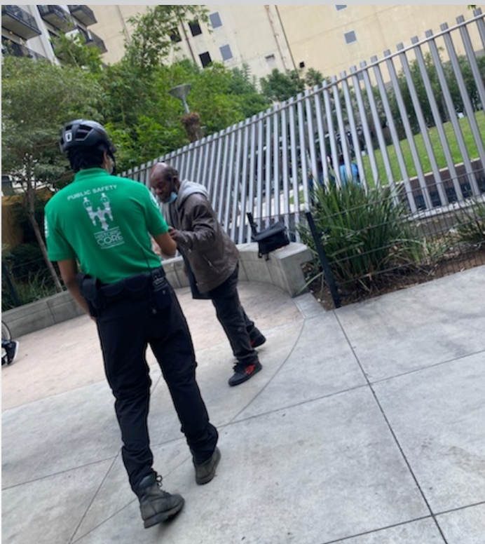
BID officers make daily contact with the homeless population in an effort to address quality of life issues.