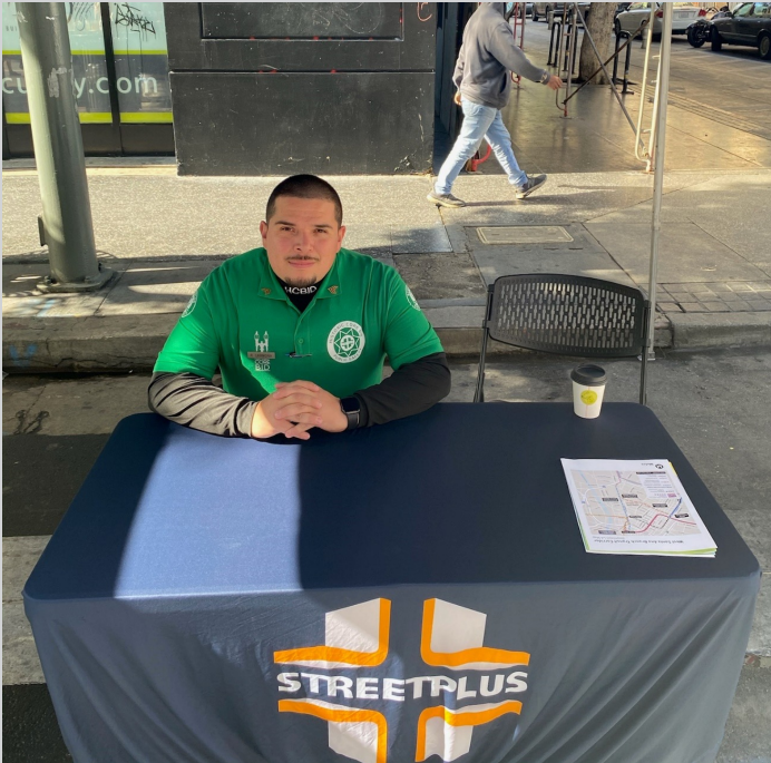
The security booth will be the main hub for officers patrolling the farmers market.