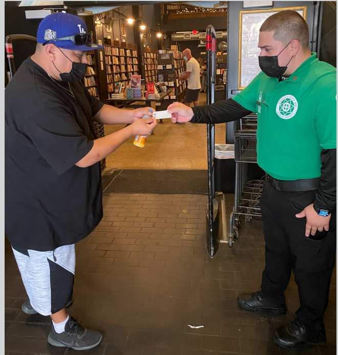
Merchant contact is what officers do best!