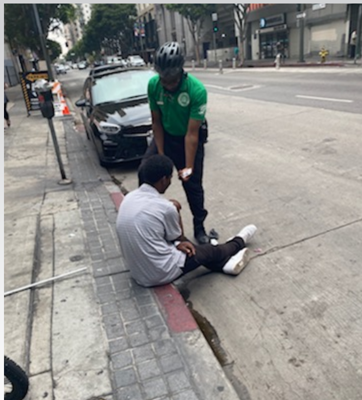
BID officers are usually first on scene for all incidents and can request additional support from local agencies if needed.