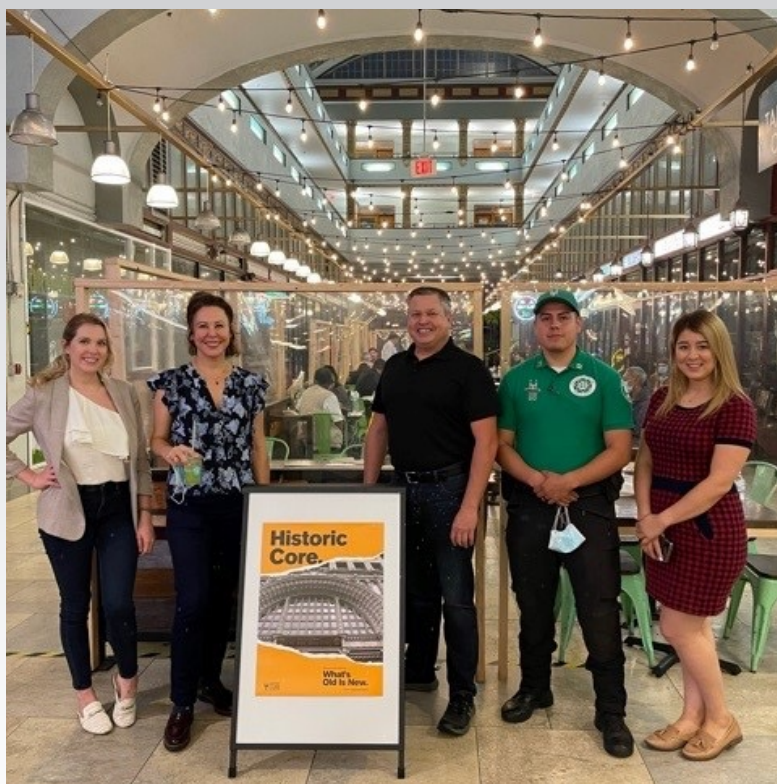
Resident night was a success! We hope to see you all again soon.