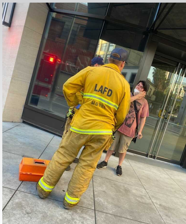
BID officers work with all local agencies in an effort to address quality of life issues.