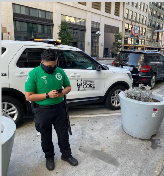
Street Plus personnel uses statview software to log in all activity throughout the district.