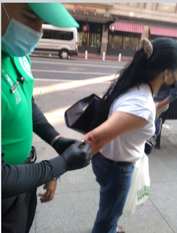
BID officers carry first aid kits all the time and can provide basic aid services.