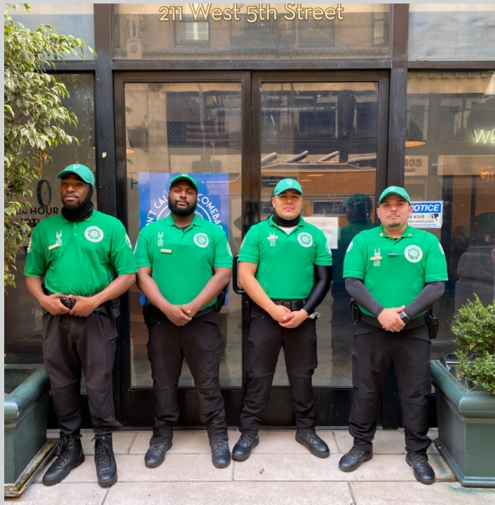
Meet our second shift crew! The BID safety team can be reached at any time by dialing the hotline.