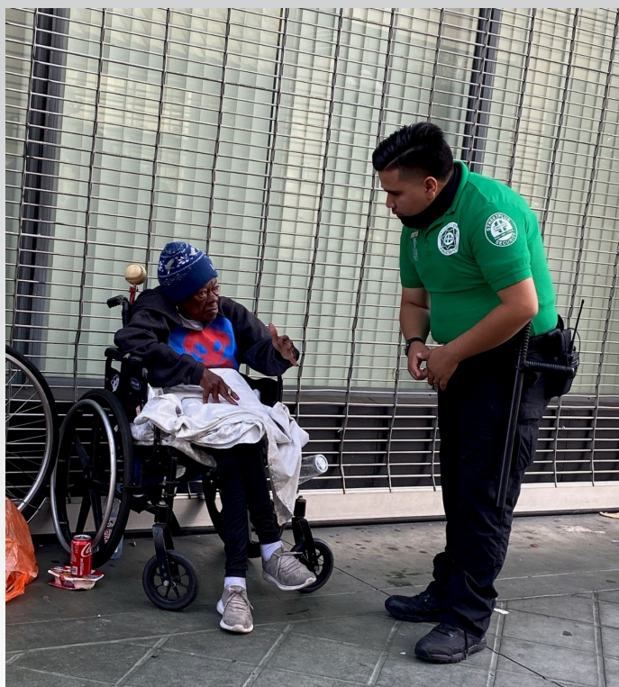
At times, BID officers can also provide outreach services.