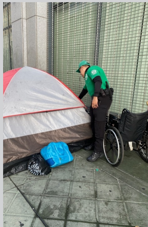
If requested, BID officers can also hand out water bottles to those in need.