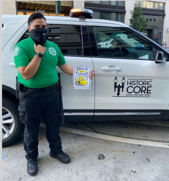
Stash it, Don't Flash it!