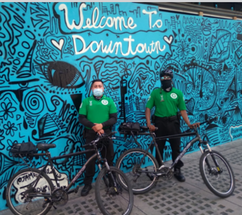
Welcome to Downtown!