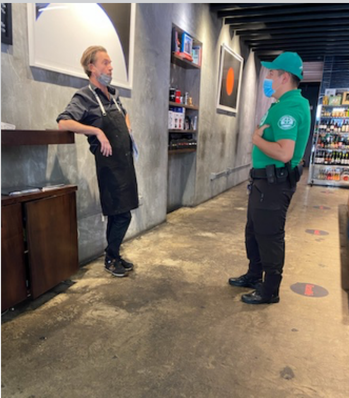
BID officers routinely make merchant contact in order to relay important information.