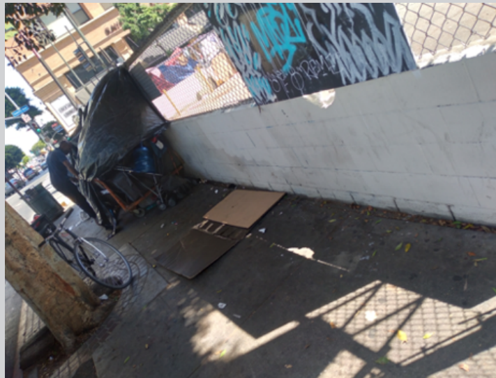
Before and After: 6th and Main