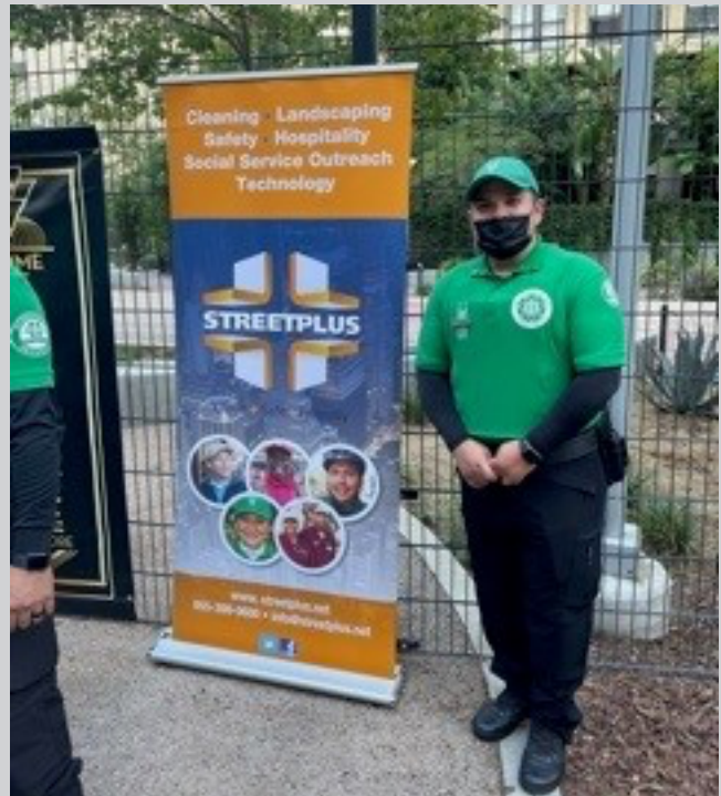
Street Plus is the official vendor for the BID's safety program.