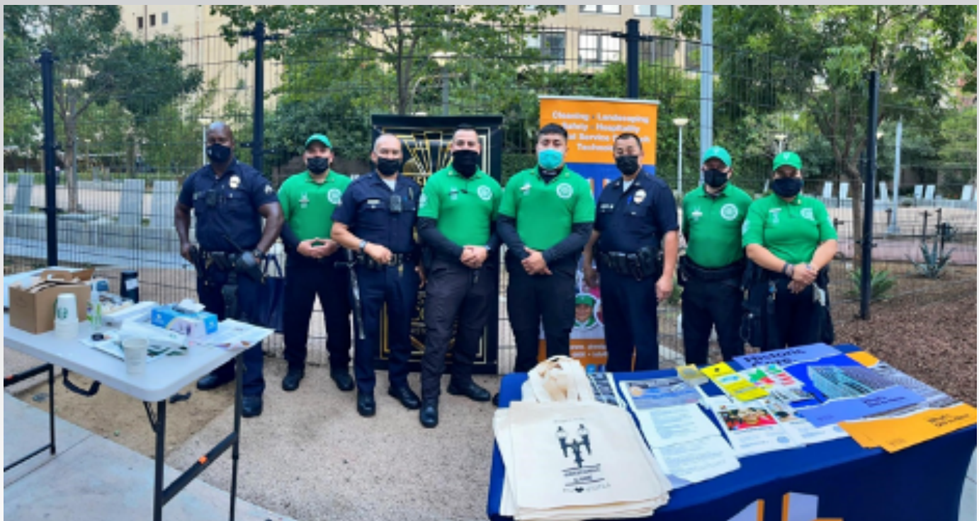
The BID is extremely grateful to have an amazing partnership with LAPD.