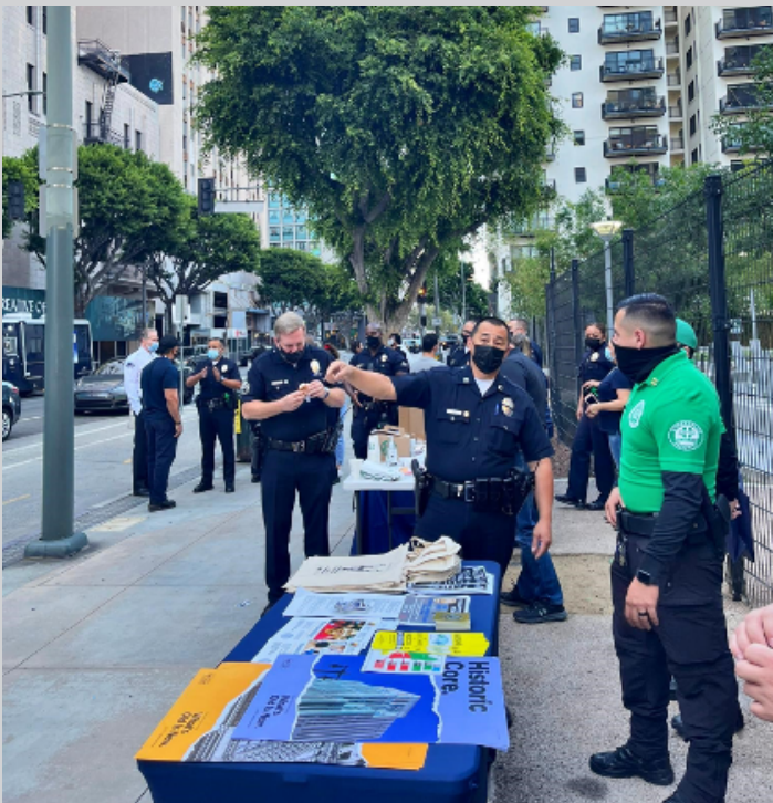
BID officers were present for national night out. An event where law enforcement and community members engage with one another.