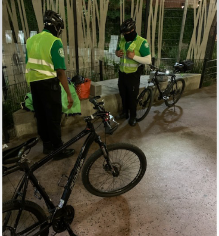
Day or night, BID officers are always out and about addressing the needs of the district.