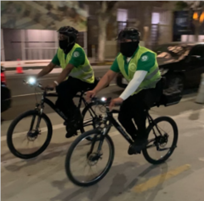
Safety first! Always make sure to be riding with the proper lighting equipment.