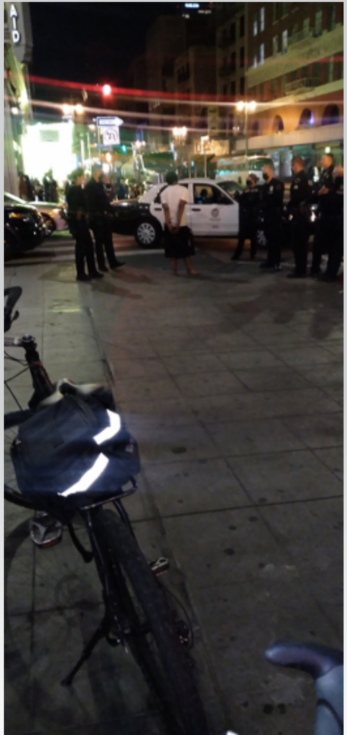
BID officers work alongside LAPD to address safety concerns in the district.