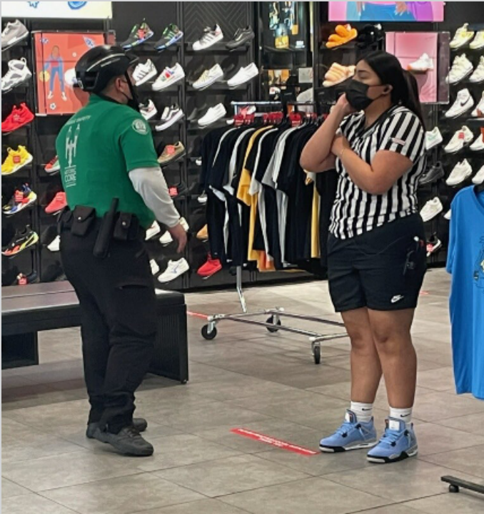
BID officers conduct merchant contacts every day to relay or receive important information.