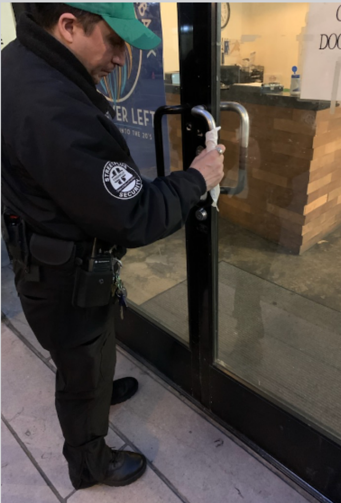
BID officers continue to sanitize common touch areas.