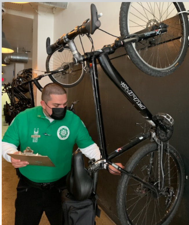
BID officers also conduct daily inspections of all equipment before hitting the field.