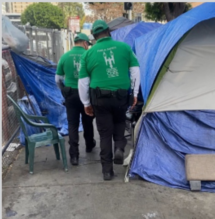
BID officers routinely conduct foot beats on Main Street.