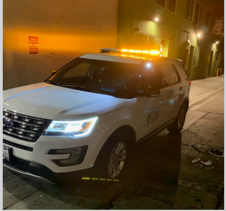
Vehicle patrols give officers extra visibility.