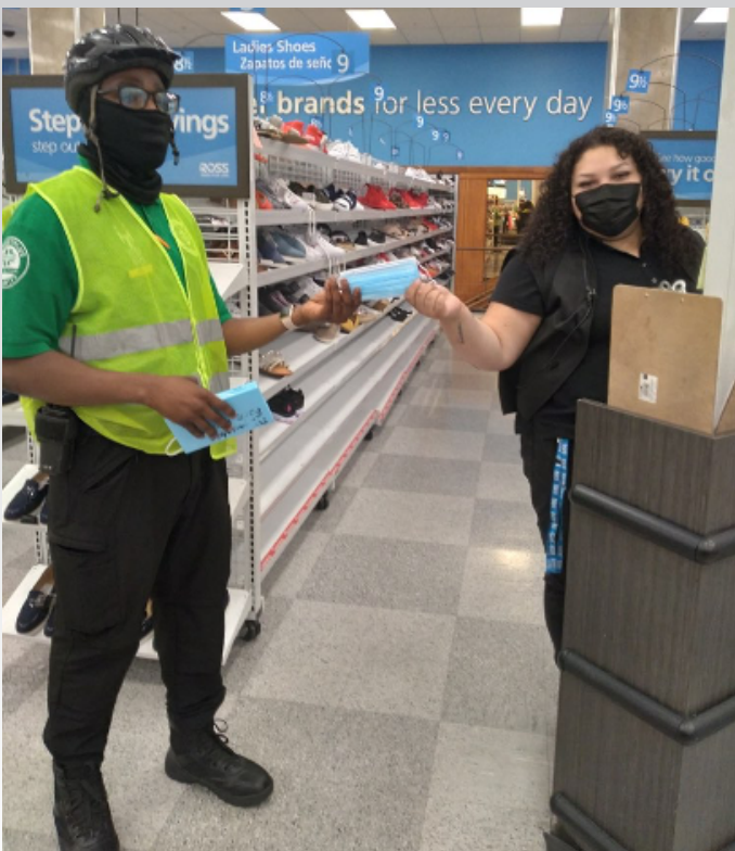
BID officers also continue to promote COVID safety by passing out face masks.