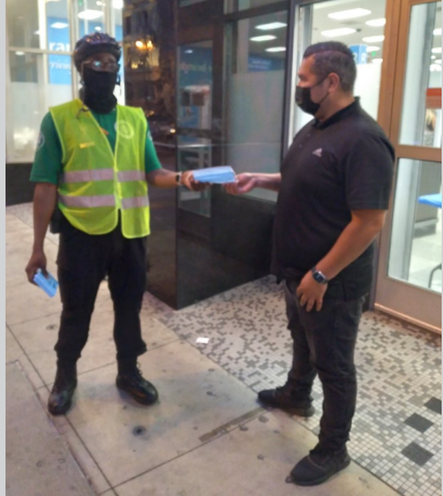
BID officers also continue to promote COVID safety by passing out face masks.