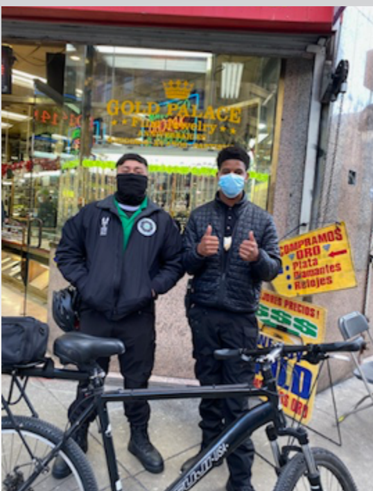
BID officers also check in with local security personnel.