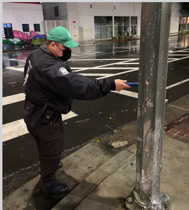
BID officers are seen here performing detex patrols at night.