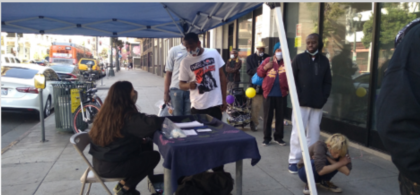
Our outreach coordinator is seen here attending the nickel diner's food drive.