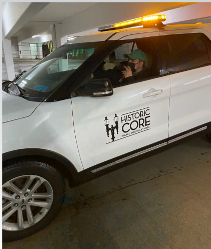
Vehicle patrols add to our presence in an effort to deter crime.