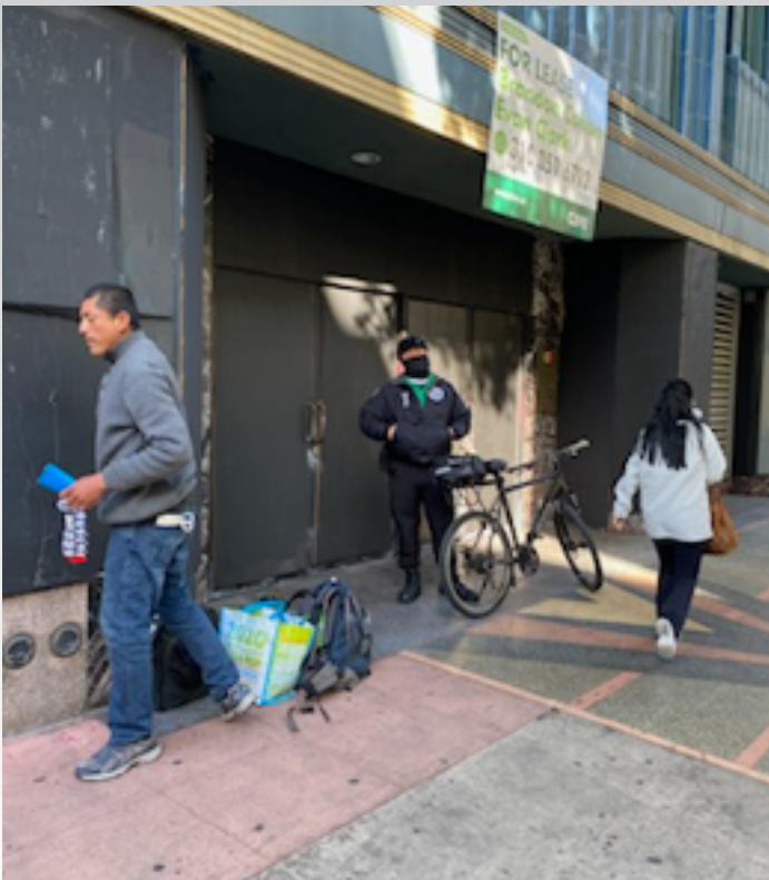
BID officers are constantly checking on quality of life issues.