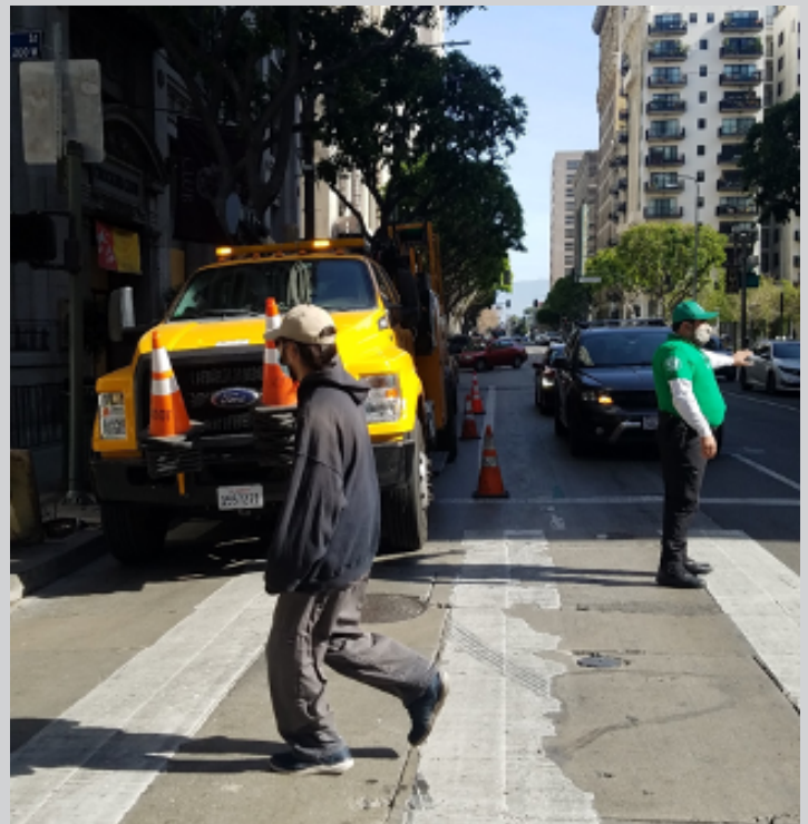
BID officers conduct a variety of tasks such as traffic control.