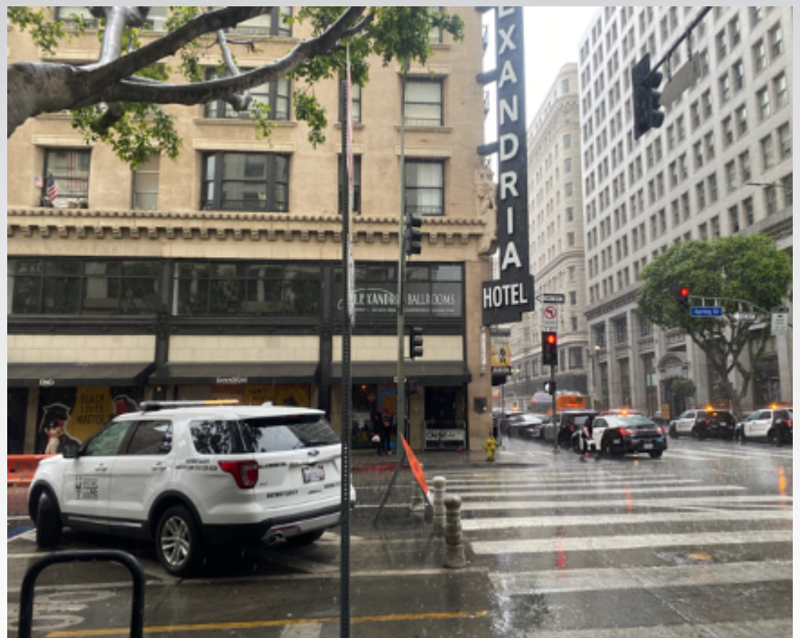
The Historic Core BID works as an extra set of eyes and ears for local law enforcement.