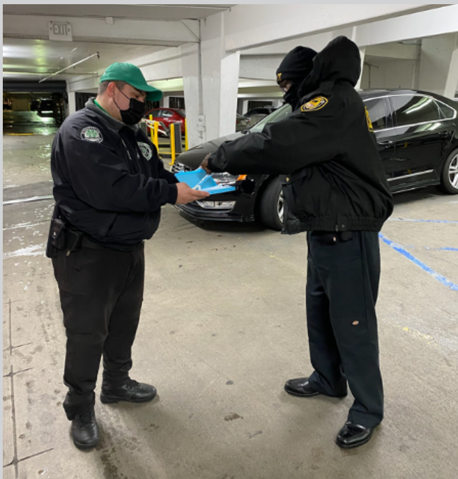
When in need, BID officers also pass out face masks to the public.