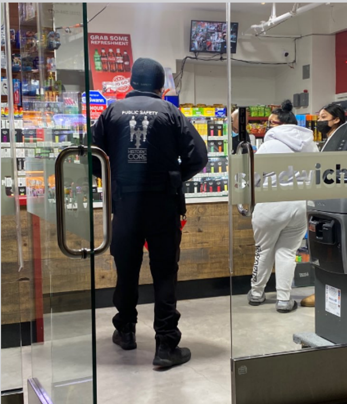
Merchant contacts allows businesses to address any safety issues/concerns.

SAFE AND FRIENDLY REPORT | FEBRUARY 2021