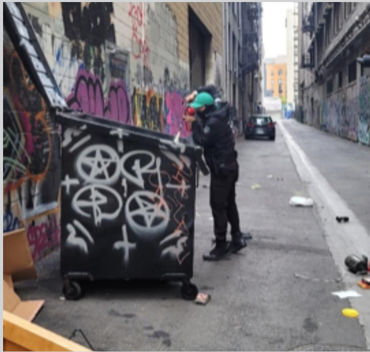
Sergeant Ramos is seen here putting out another dumpster fire.