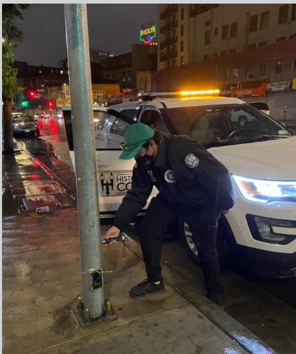
BID officers are seen here performing detex patrols at night.