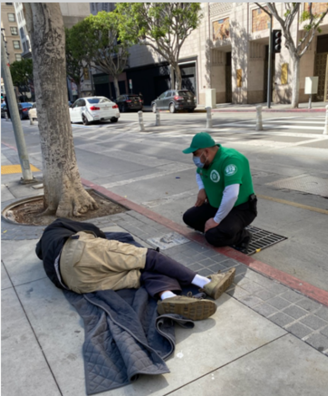
BID officer attempt different approaches when making contact with the homeless population.