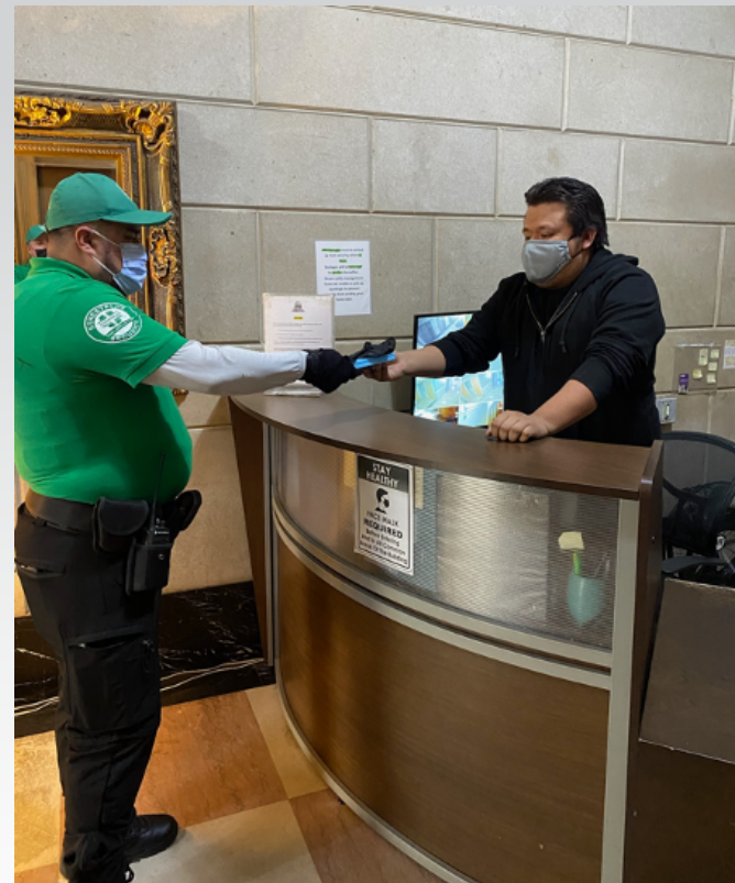
Passing out distributions is a quick and simple way of staying informed.