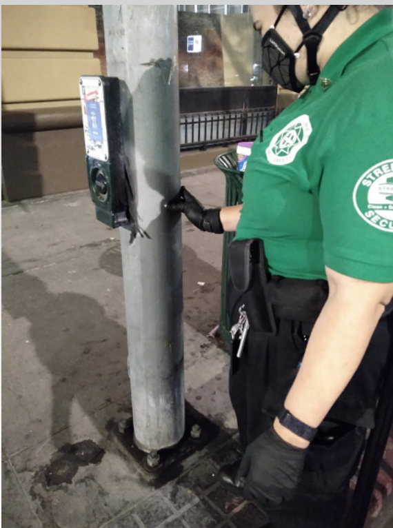
BID officers use the detex point system to ensure all hot spot zones are overseen.