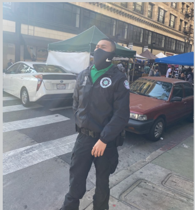
BID officers provide an extra set of eyes and ears for local law enforcement.