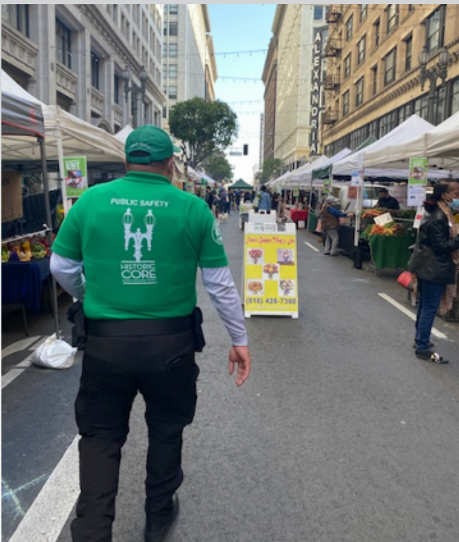
Our goal every Sunday is to ensure a safe environment for those visiting our farmers market.