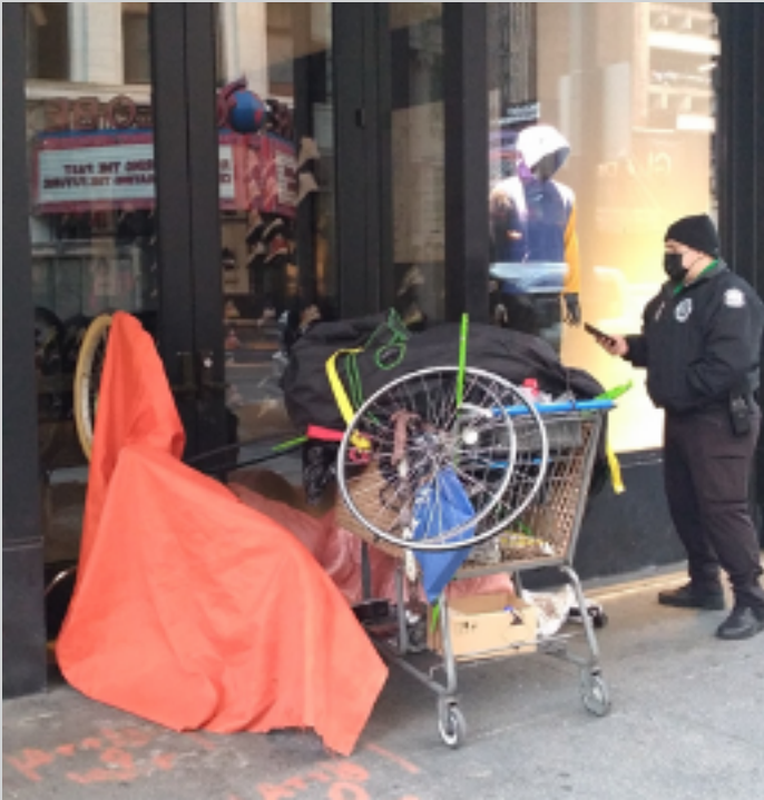
BID officer Carmona is seen here conducting a wellness check.