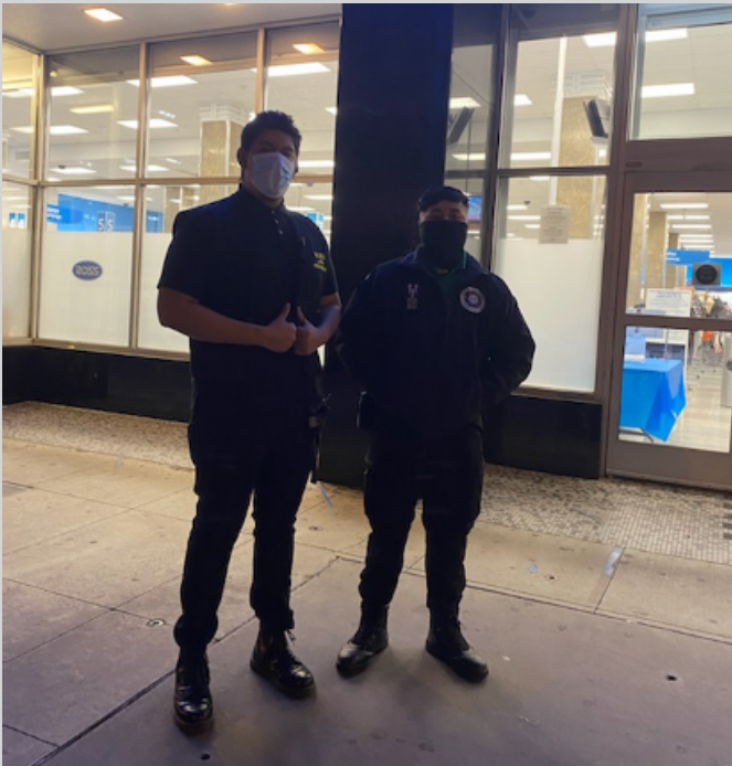
BID officers stay in close contact with other security agencies in an effort to deter crime.