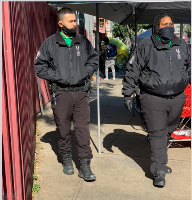
BID officers also patrol main street on foot in an effort to deter crime