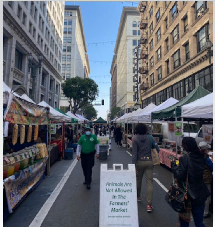
BID officer Cervantes is seen here casually strolling by the farmers market.