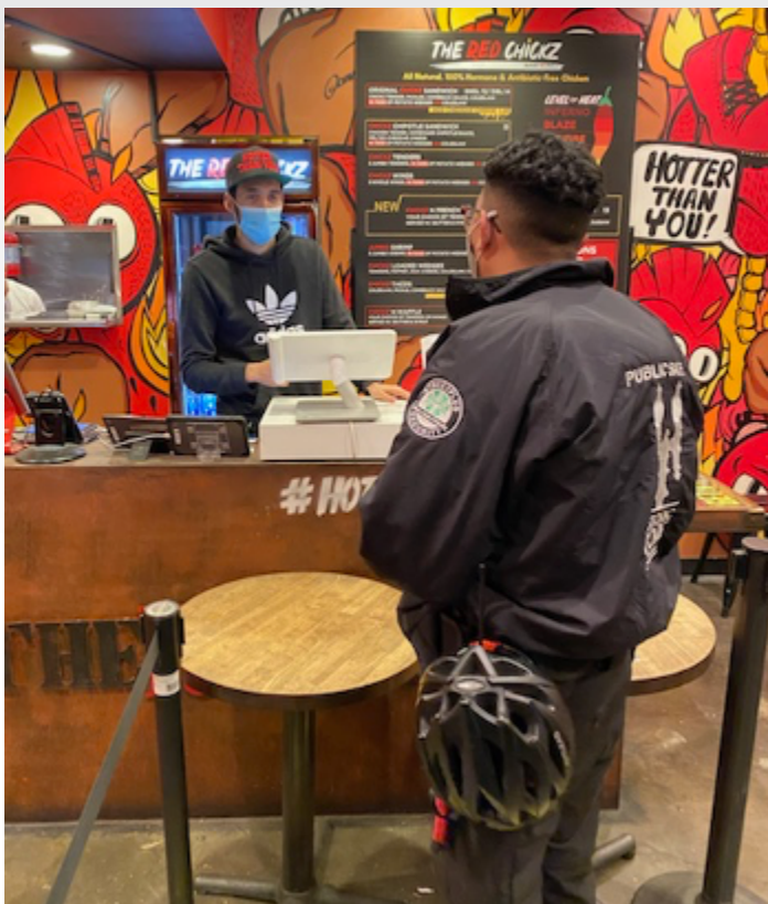
BID officers routinely conduct business checks with the local merchants.