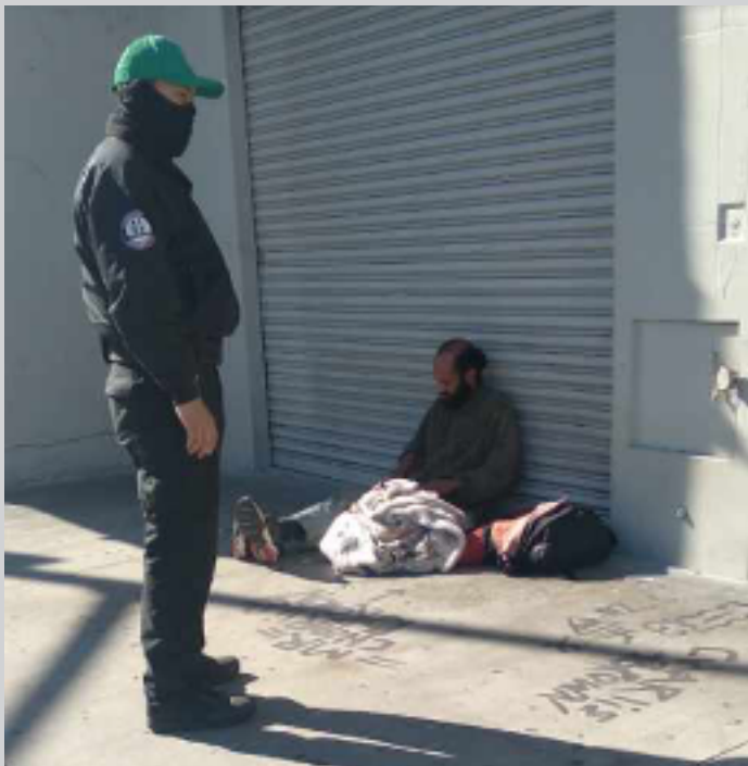
BID officers remain proactive throughout the district in all types of weather.