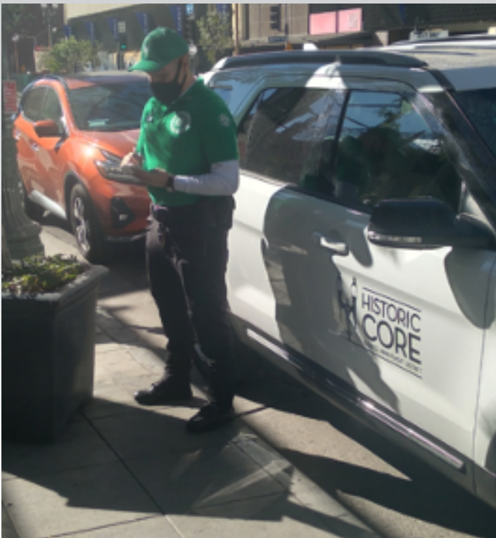
BID officers make observations and later translate them using Street Plus software.