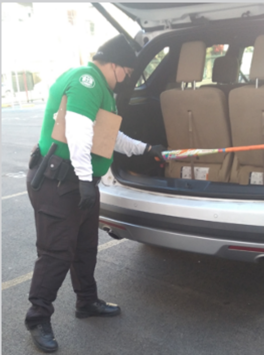
BID officers were also able to retrieve a metal bat from the parking lot.