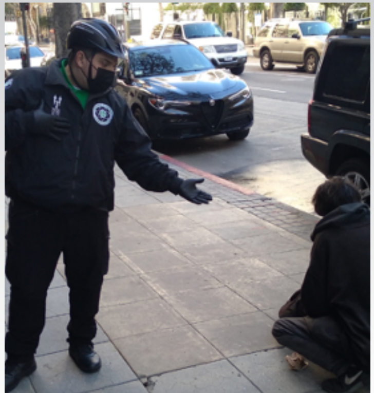
BID officers love to lend a hand when needed.