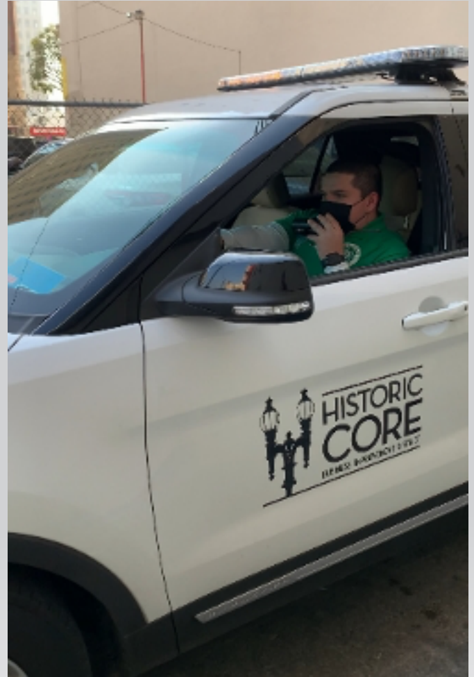
BID officers use the latest technology to stay in constant communication with each other throughout the district.