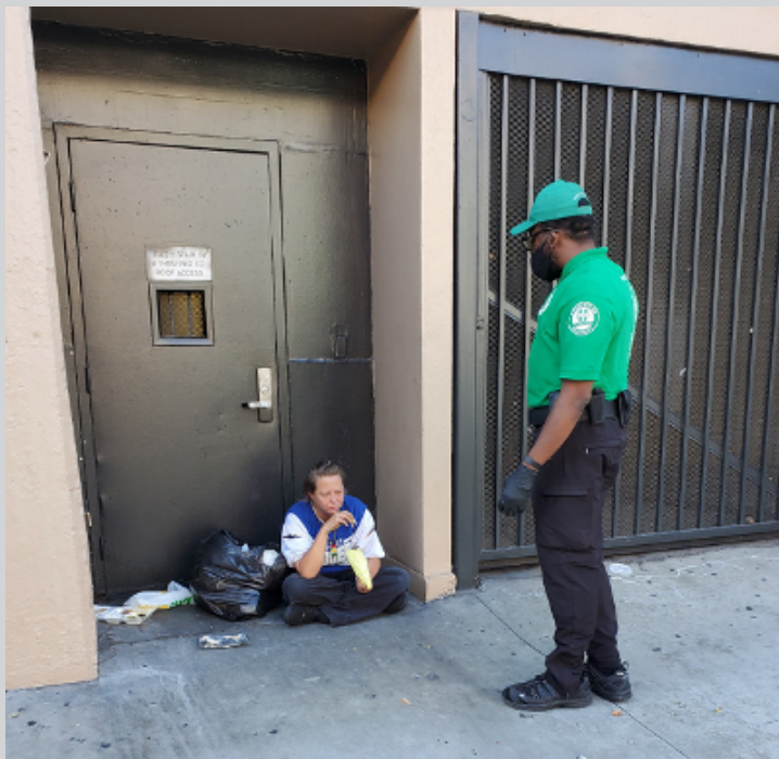
Officers address all quality of life issues in the historic core.