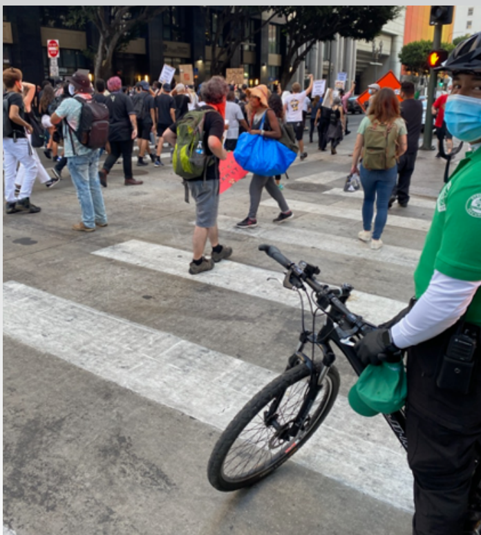
As the civil unrest continues, officers were present in order to keep the protests as peaceful as possible.