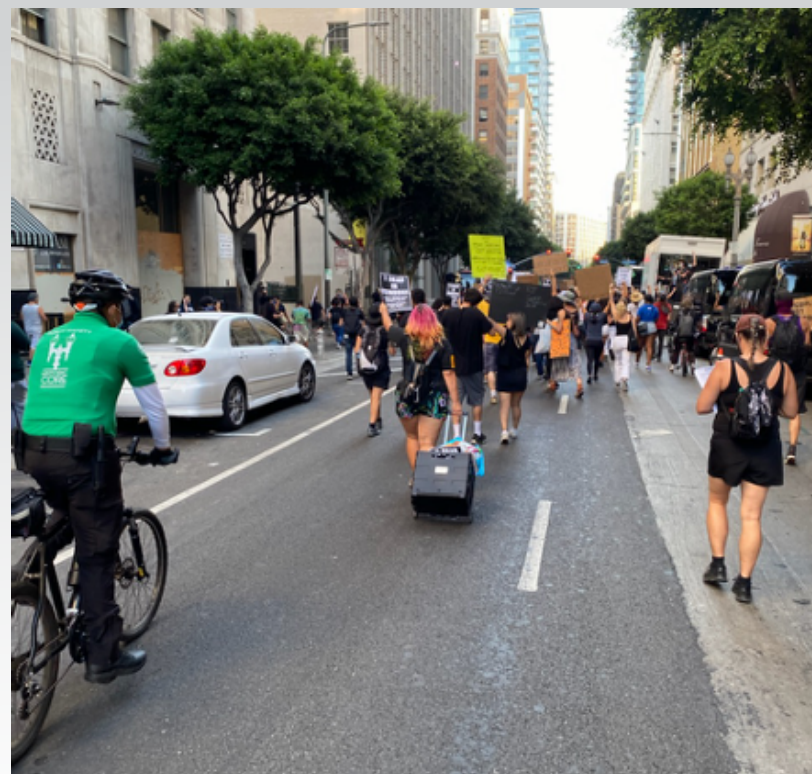
Officers followed closely as the protestors marched through the district.