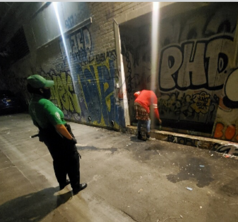
Day and night, officers constantly make routine checks in every alleyway.