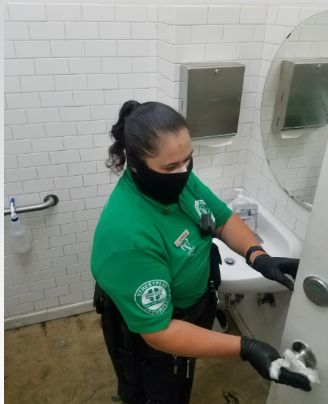
In order to ensure safety in the workplace, officers wipe down and disinfect common areas.