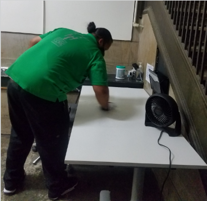
In order to ensure safety in the workplace, officers wipe down and disinfect common areas.