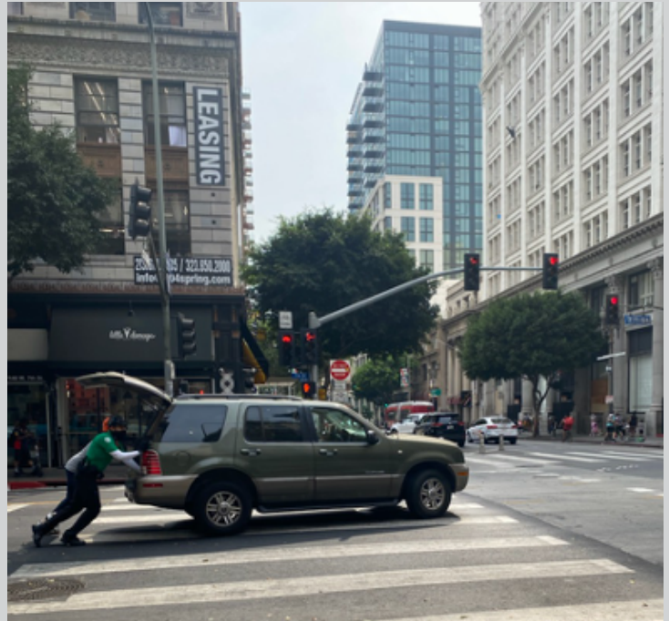
Need a hand? Please let our officers know how they can assist.