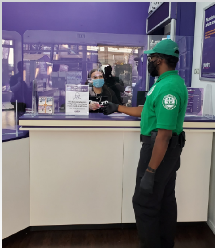
Officers also make routine merchant contacts throughout the day.