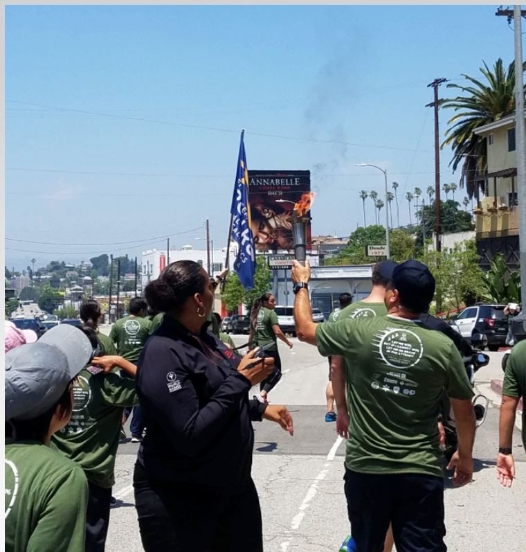
HCBID Headquarters (Before)