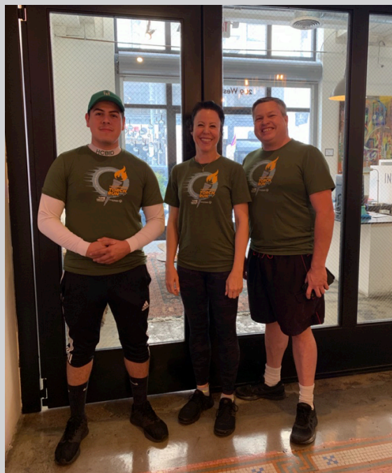
Street Plus and the HCBID staff participated in the Special Olympics torch run.