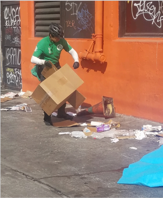
At times, we will even pick up debris in order to ensure the cleanliness in our district.