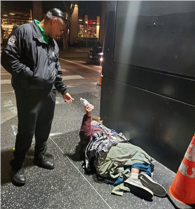
Officers conduct wellness checks at all hours of the night