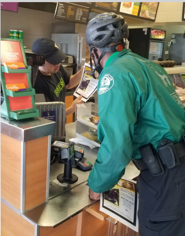
Due to a spike in vehicle break-ins, officers raised awareness among the community by passing flyers.