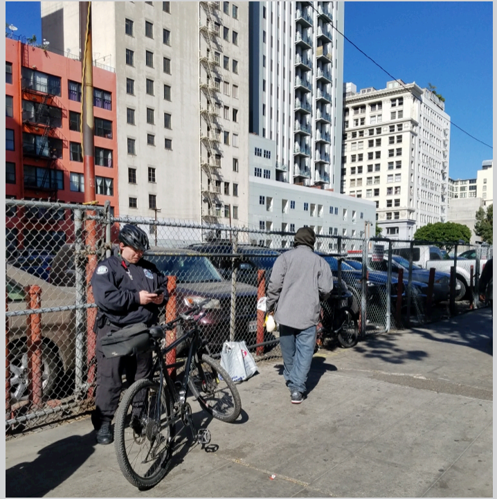
Using the latest software, Street Plus staff ensures to input all daily activities into a cloud server.